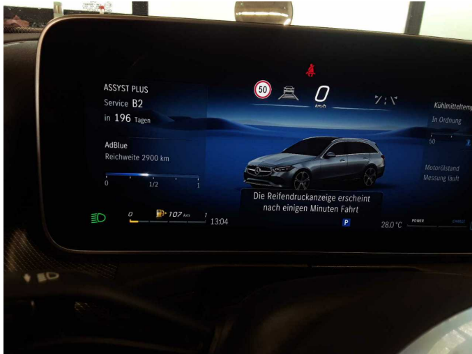
Figure 31: Misc.