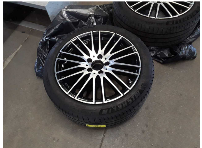
Figure 24: Misc.