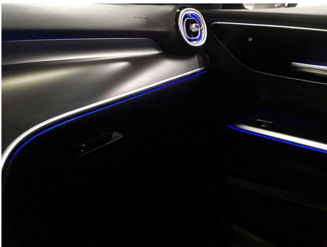
Figure 29: Misc.