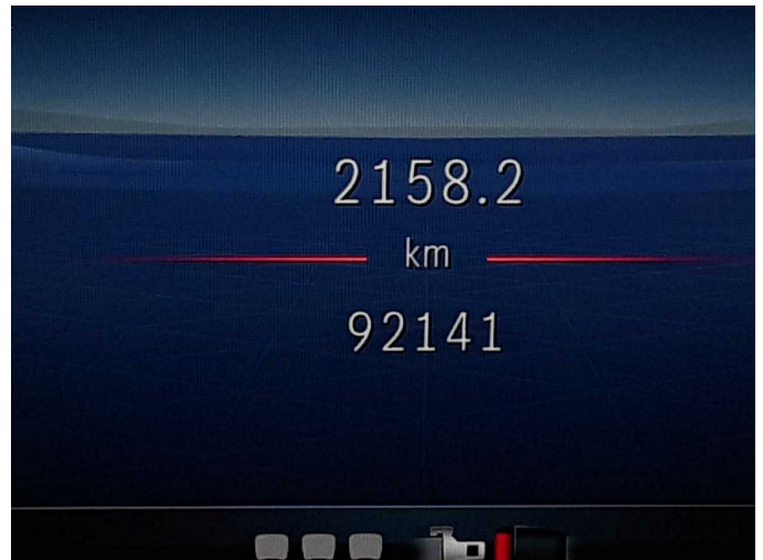
Figure 28: Misc.