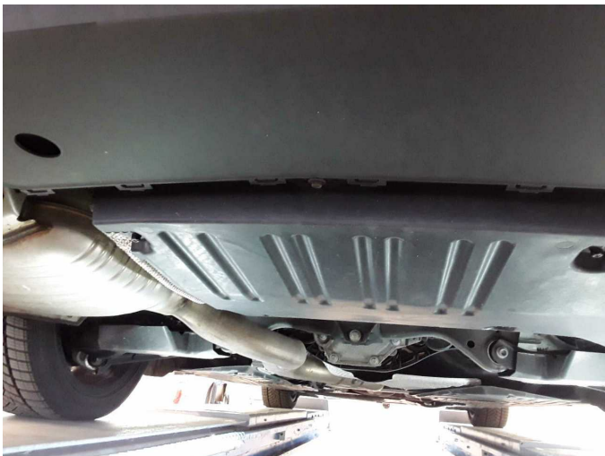
Figure 23: Misc.