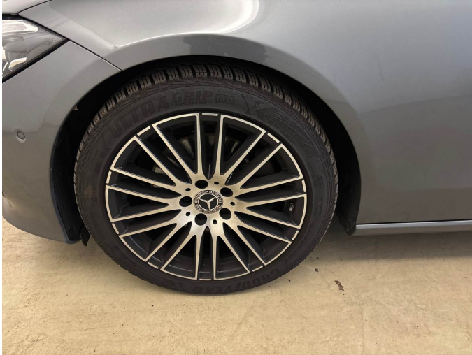
Figure 13: Mounted tyres