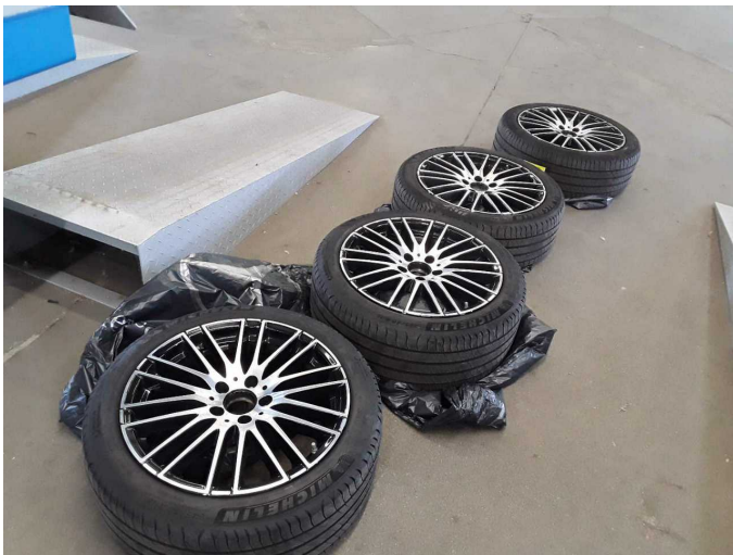
Figure 15: Additional tyres