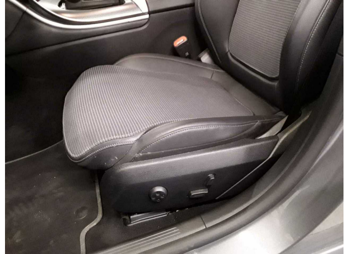
Figure 26: Misc.