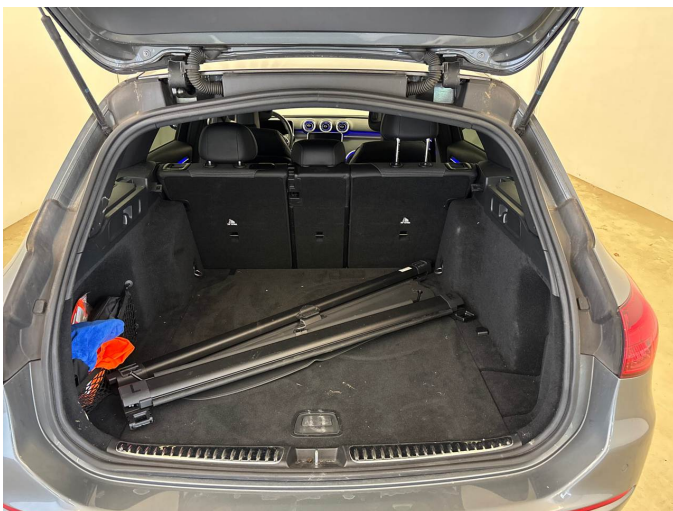
Figure 11: Cargo area