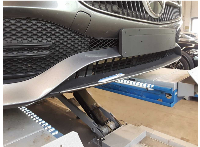
Damage 1: Front bumper: Spoiler - Damaged - Replace