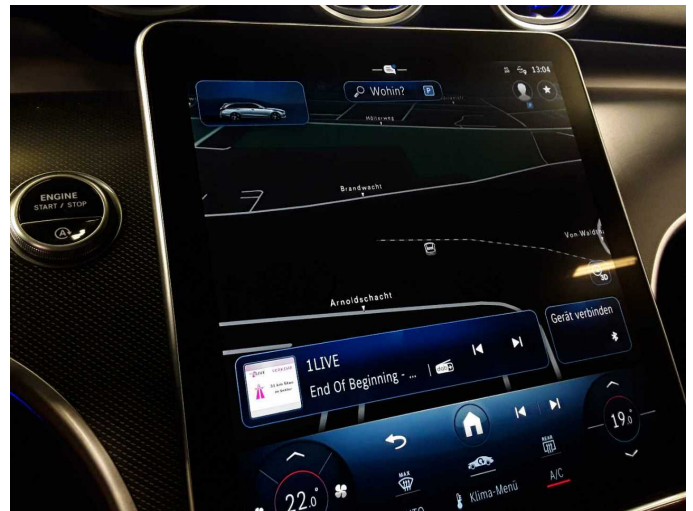
Figure 16: Navigation