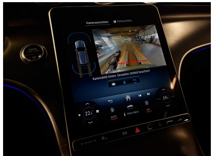
Figure 30: Misc.