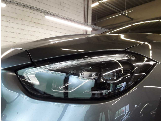
Figure 25: Misc.