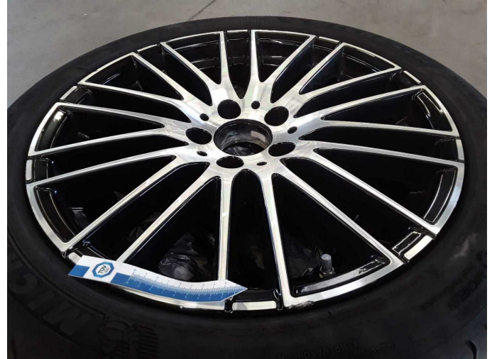
Damage 3: 2nd wheel set: 2 alloy rims - Scratched - Loss in value