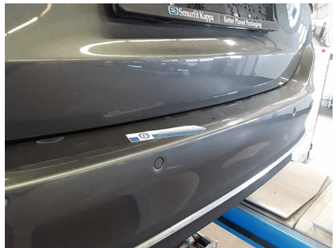
Damage 2: Rear bumper: Rear bumper - Scratch(es) - Smart repair