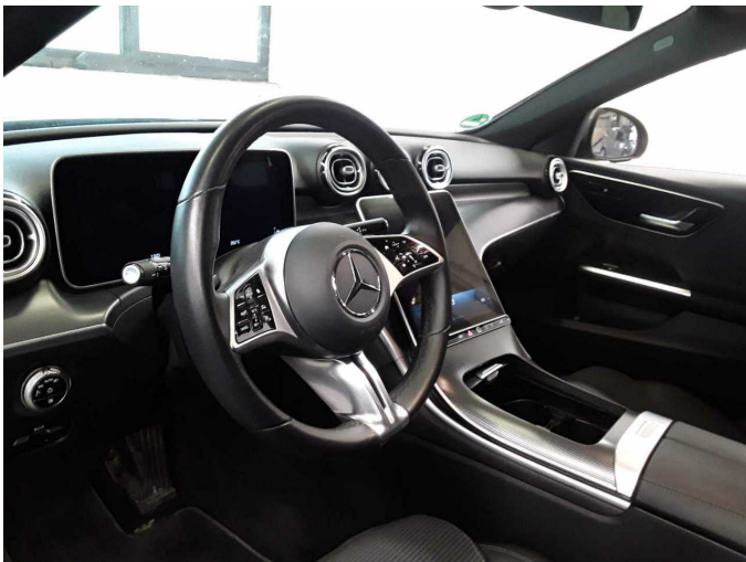
Figure 27: Misc.