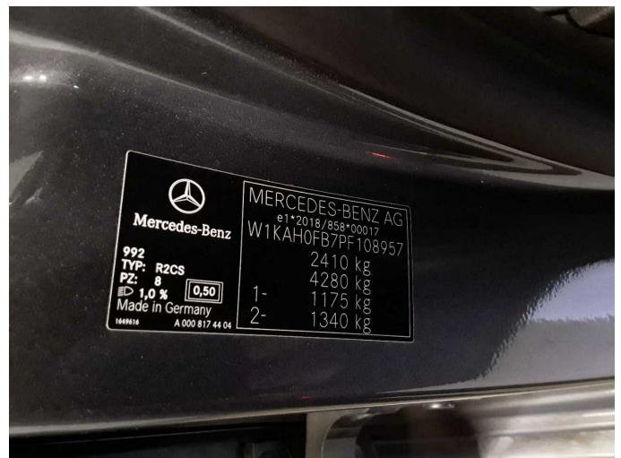
Figure 12: VIN