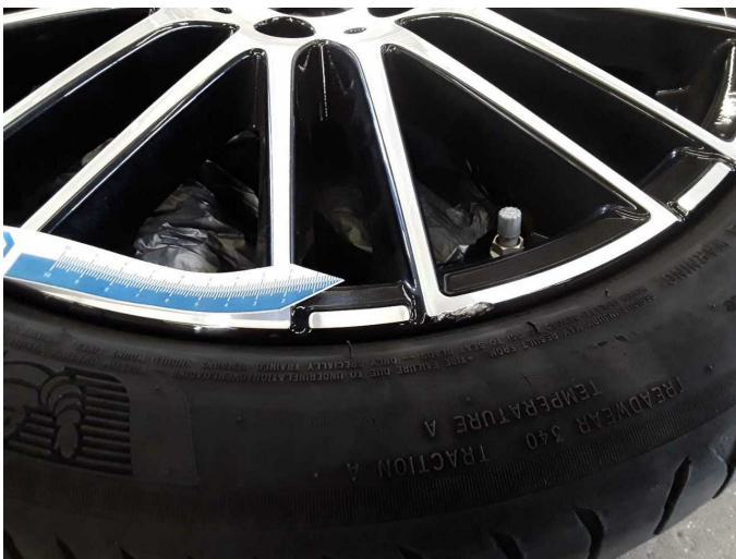
Damage 3: 2nd wheel set: 2 alloy rims - Scratched - Loss in value