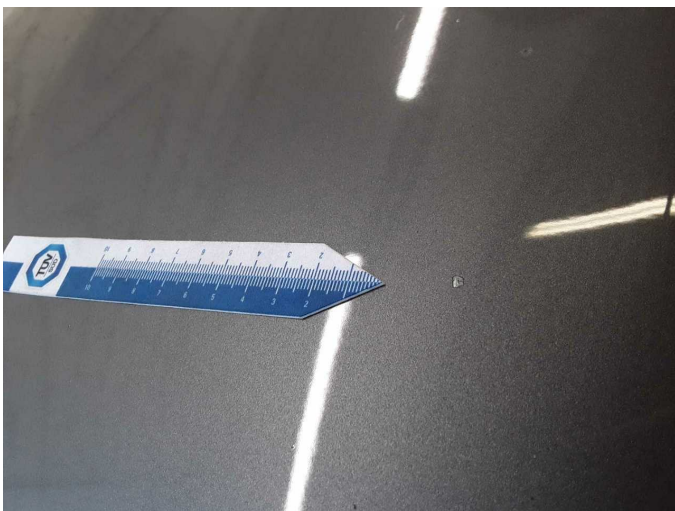
Wear and tear 1: Bonnet: Bonnet - Stone chips - No deduction