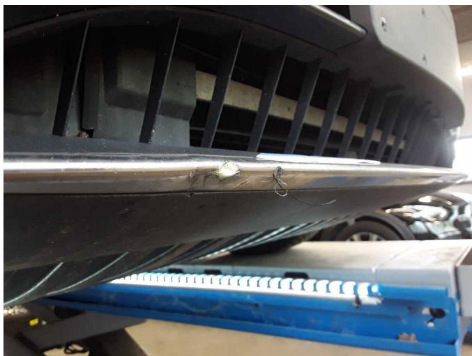
Damage 1: Front bumper: Spoiler - Damaged - Replace