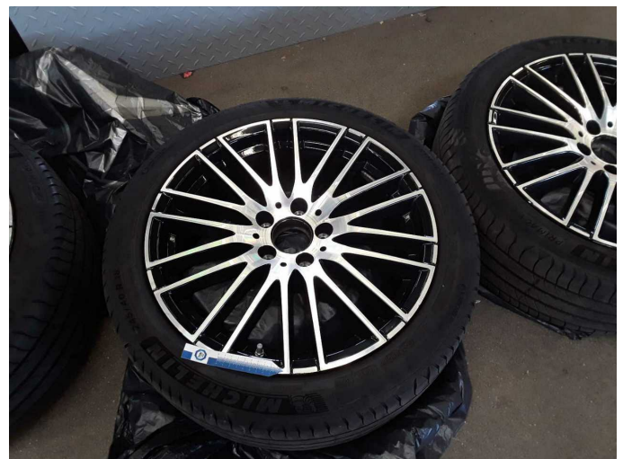
Damage 3: 2nd wheel set: 2 alloy rims - Scratched - Loss in value