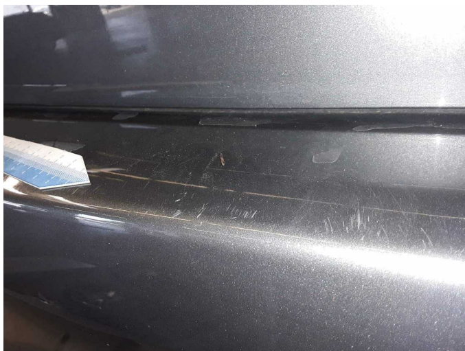
Damage 2: Rear bumper: Rear bumper - Scratch(es) - Smart repair