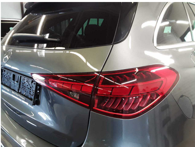
Figure 17: Misc.