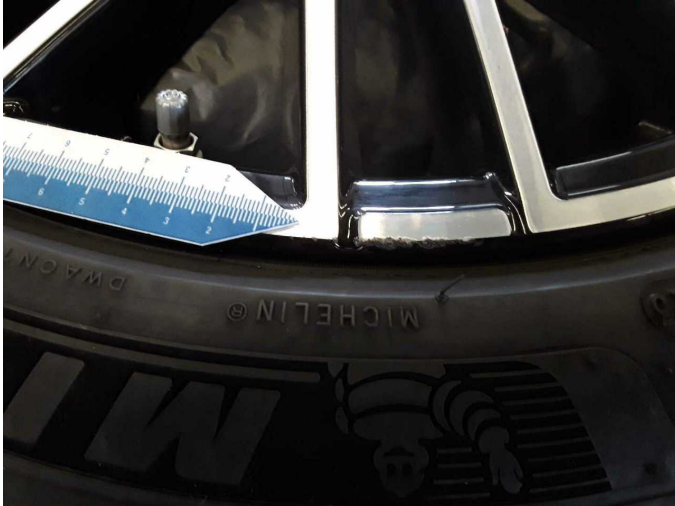
Damage 3: 2nd wheel set: 2 alloy rims - Scratched - Loss in value