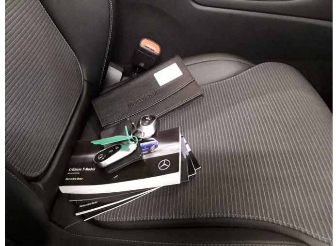
Figure 14: Documents