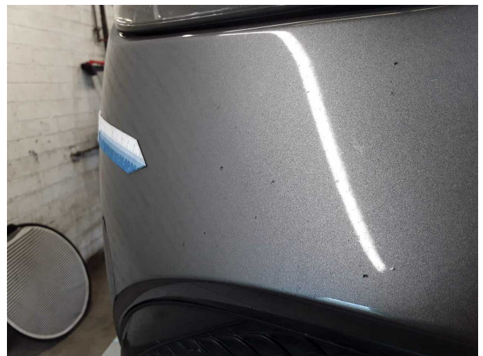
Wear and tear 4: Front bumper: Front bumper - Stone chips - No deduction