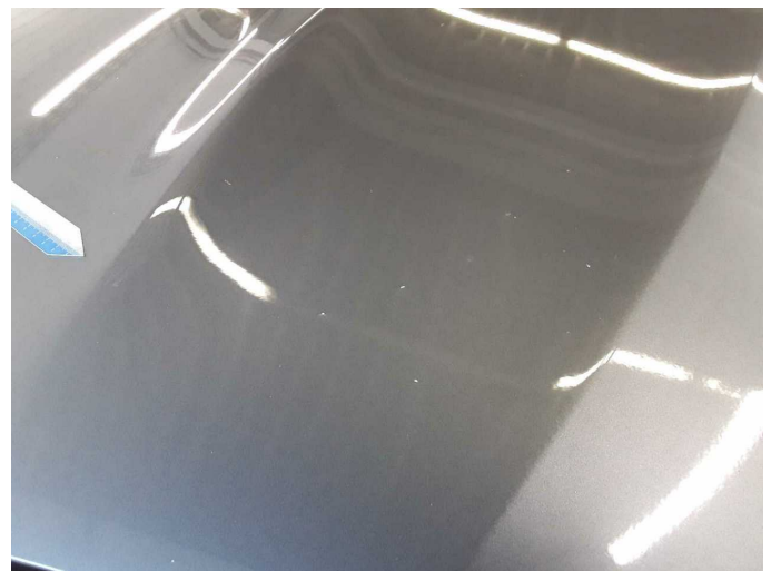
Wear and tear 1: Bonnet: Bonnet - Stone chips - No deduction