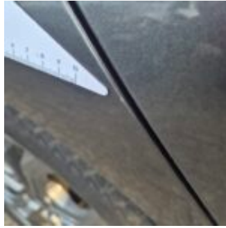
Damage Type Stonechipping