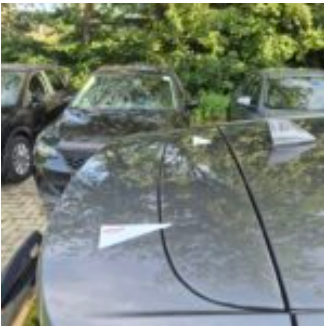
Damage Part Tailgate