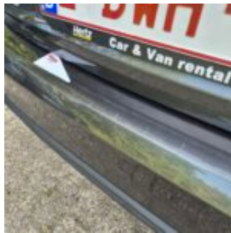
Damage Type Scratch(es)