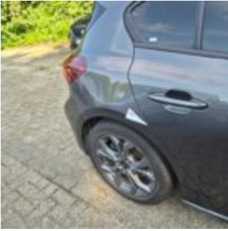
Damage Part Fender - Rear Right