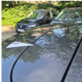
Damage Type Small dent(s)