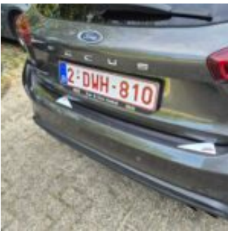
Damage Part Bumper - Rear