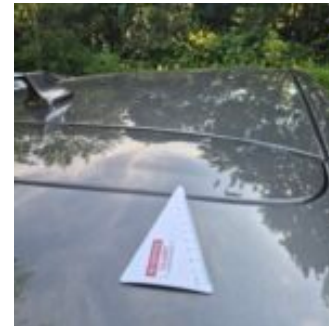
Repair Type Restyle