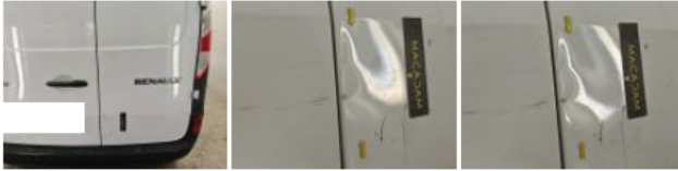
Boot door panel RL, Dent(s), Repair and paint (complete)