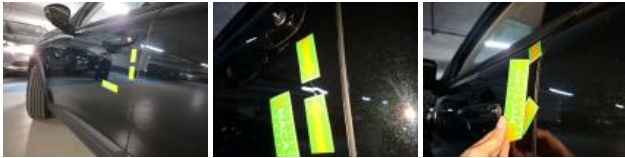
Bumper moulding F, Scratch(es), Replace