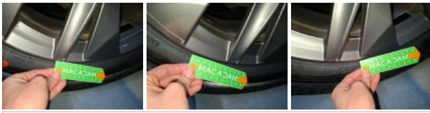
Alloy rim FR, Scratch(es), Repair/replace (lump sum)