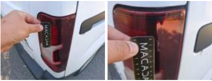
Bodywork, Not original part, Sticker removal small