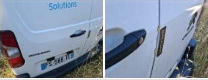
Bumper R, Deformed / Strained, Repair and paint (complete)