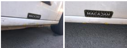
Door trim FR, Scratch(es), Replace