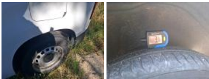
Tyre RR, Out of tolerance, Replace