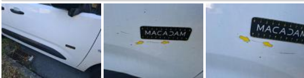
Sliding door R, Scratch(es), Paint