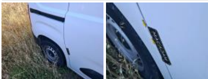
Outer sill R, Dent(s) and scratch(es), Repair and paint (complete)