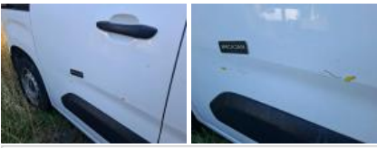
Boot door panel RL, Dent(s), Repair and paint (complete)