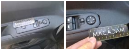
Inner door sill FL, Scratch(es), Paint