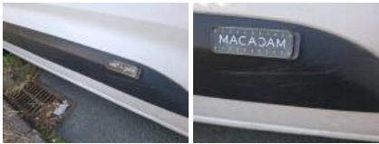
Door FR, Scratch(es), Paint