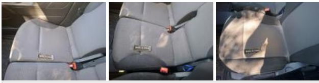
Interior trim, Unclapsed, Dismount/Mount