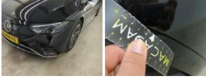
Bumper moulding FL, Scratch(es), Replace and paint