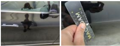
Roof pillar R, Scratch(es), Repair and paint (complete)