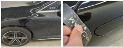
Bonnet, Scratch(es), Polish