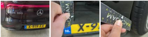
Tailgate / Boot, Scratch(es), Repair and paint (complete)