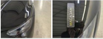
Bumper F, Scratch(es), Repair and paint (complete)