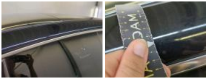
Rear window, Scratch(es), Replace