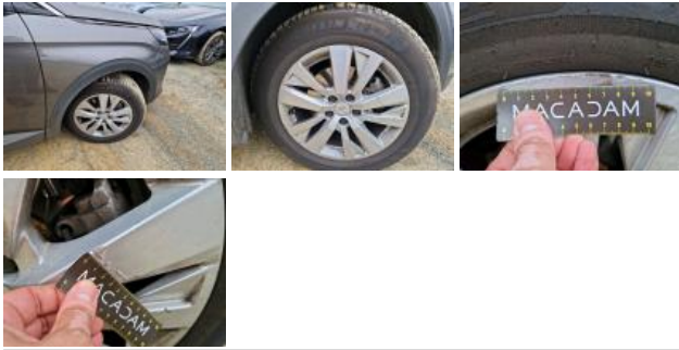
Alloy rim RL, Scratch(es), Repair/replace (lump sum)