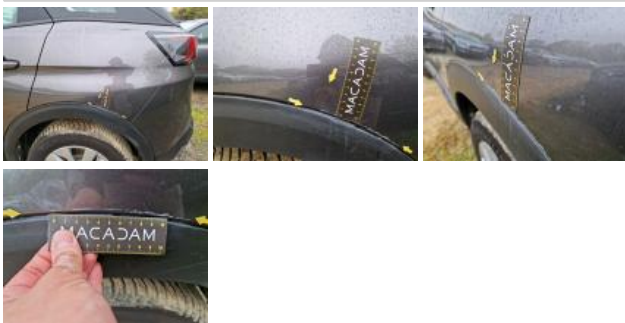
Wing trim RL, Scratch(es), Replace