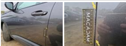
Door RR, Scratch(es), Polish