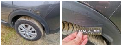
Door FL, Scratch(es), Paint