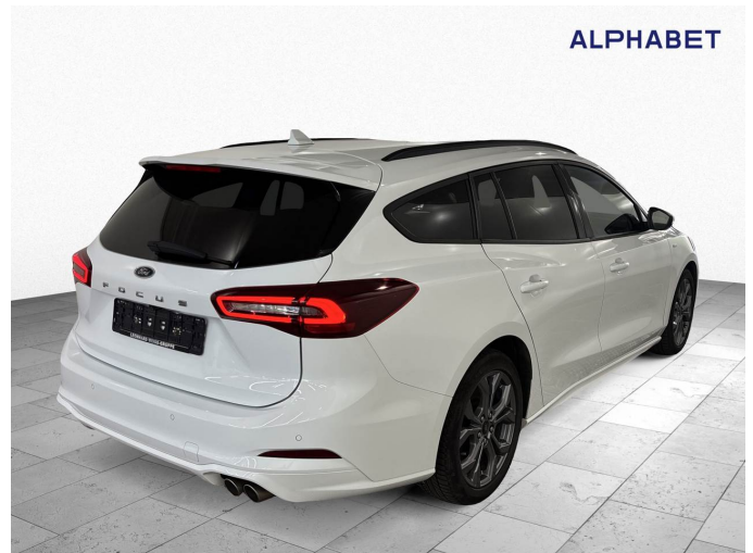
Figure 4: Diagonal rear (right)