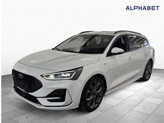
Figure 1: Diagonal front (left)