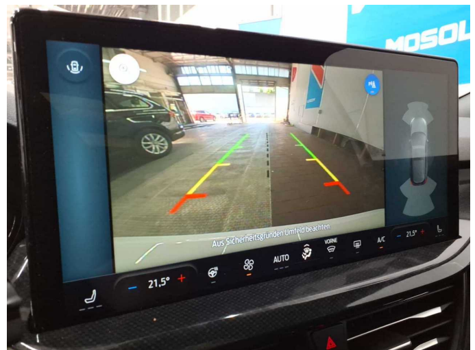
Figure 22: Misc.