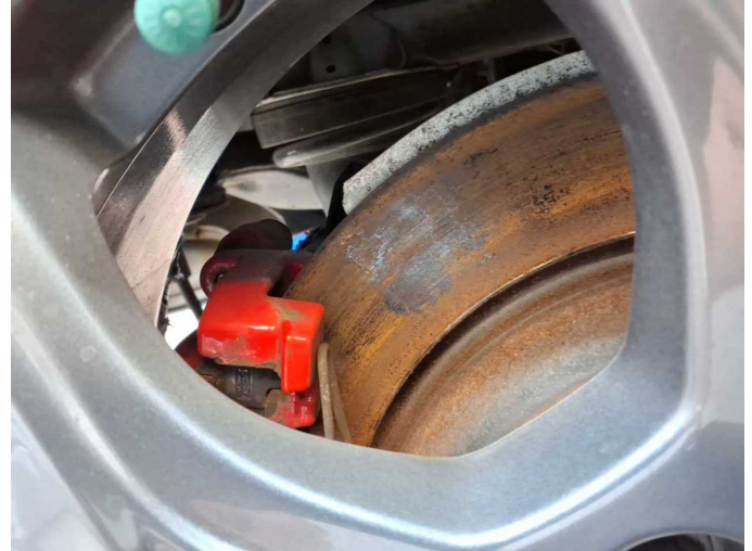
Damage 3: Braking system: Brake discs and pads - rear (Freibremsen) - Corrosion