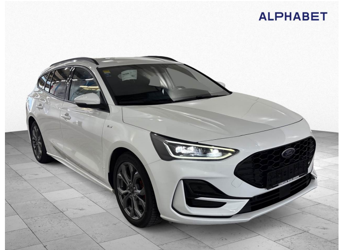
Figure 2: Diagonal front (right)