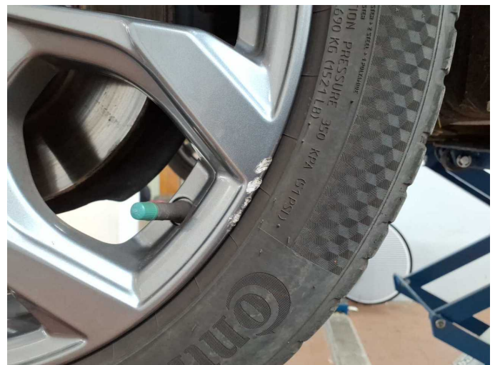
Damage 6: Wheel / tyres: Alloy rim - front left side - Scratch(es) - Loss in value