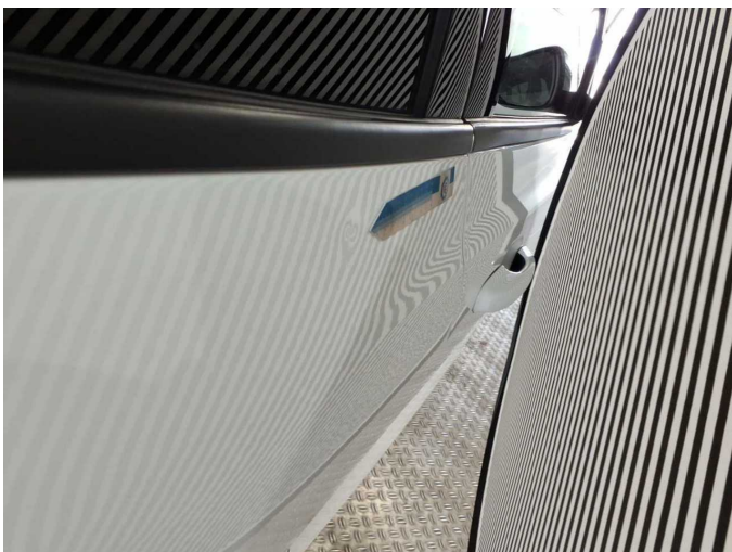
Damage 2: Door - rear right side: Door - dent(s) - Smart repair