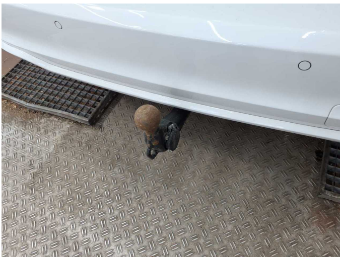
Figure 29: Misc.