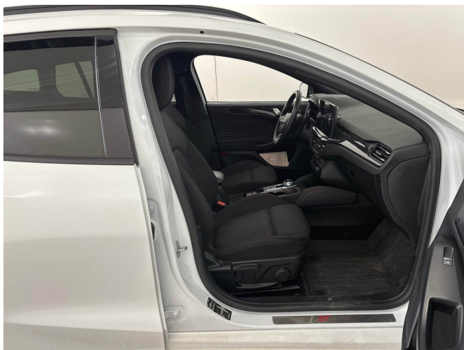
Figure 5: Interior - front