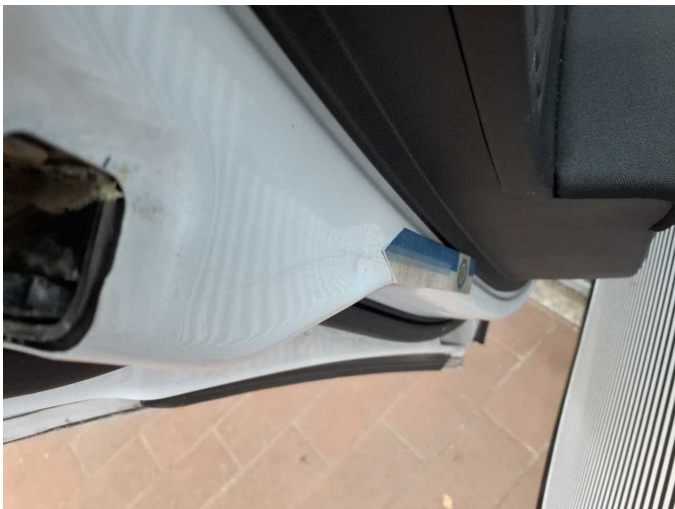
Damage 1: Door - rear left side: Door (Innen) - dent(s) - Smart repair