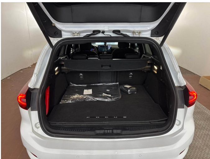
Figure 11: Cargo area