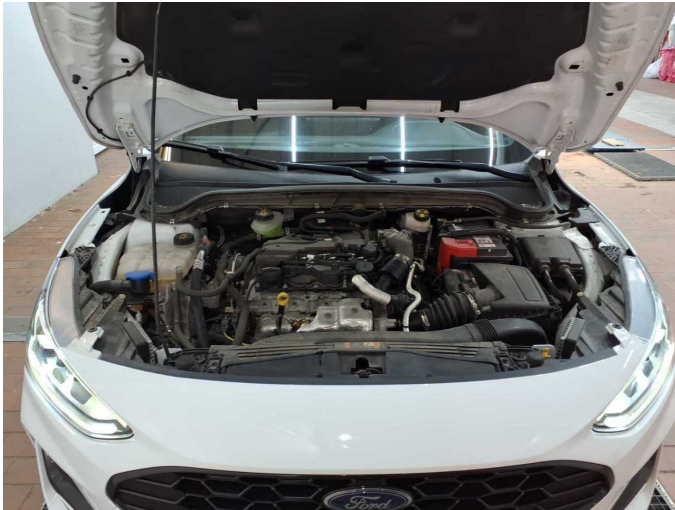
Figure 25: Misc.