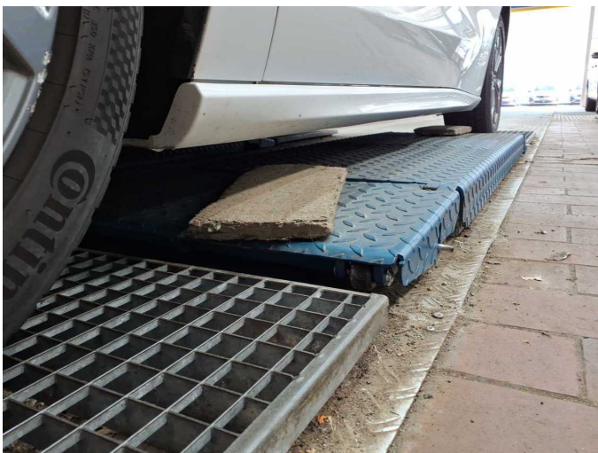
Figure 23: Misc.