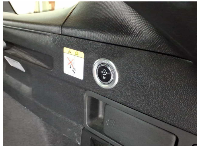
Figure 28: Misc.