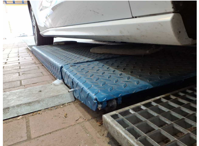
Figure 26: Misc.