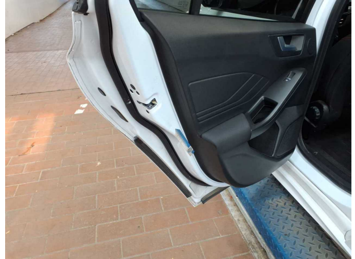
Damage 1: Door - rear left side: Door (Innen) - dent(s) - Smart repair