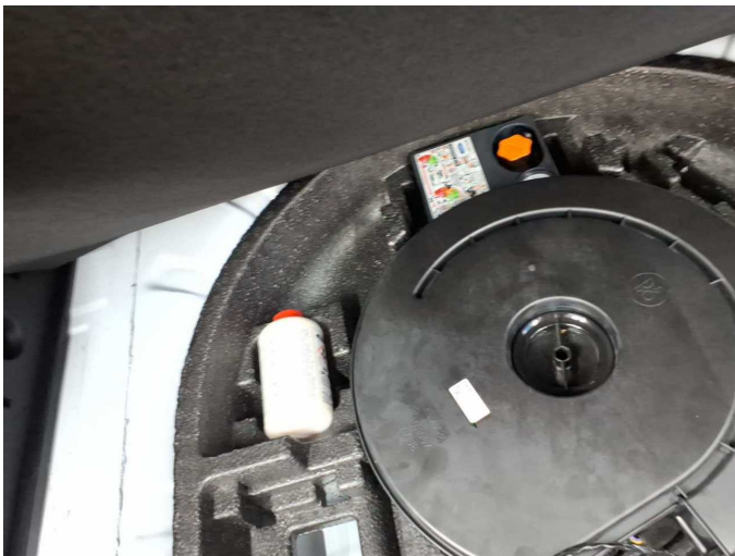
Figure 27: Misc.