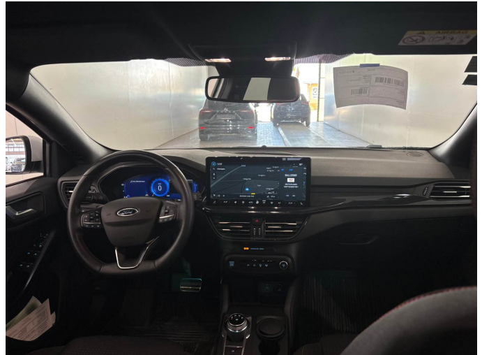
Figure 8: Instrument panel