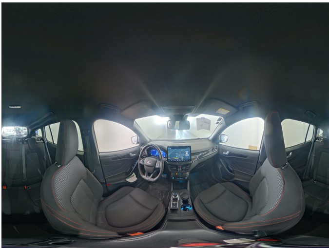
Figure 9: Interior 360° view