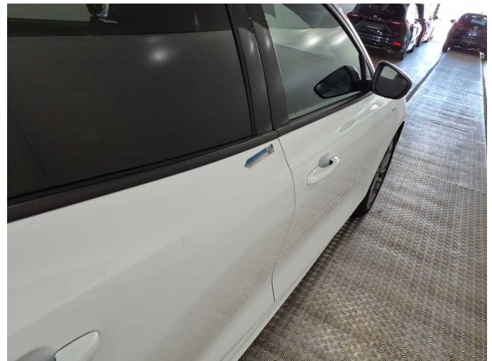
Damage 2: Door - rear right side: Door - dent(s) - Smart repair