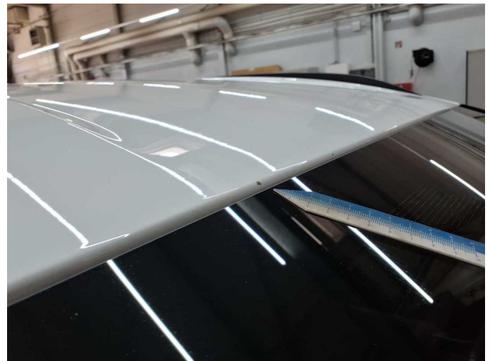
Damage 4: Roof: Roof - Stone chips - Smart repair