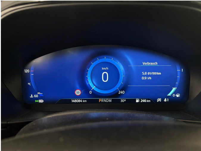
Figure 7: Instrument cluster