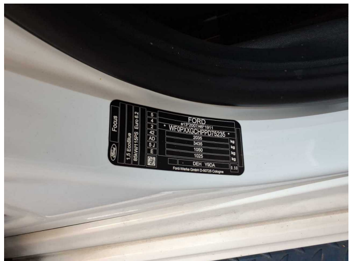
Figure 12: VIN