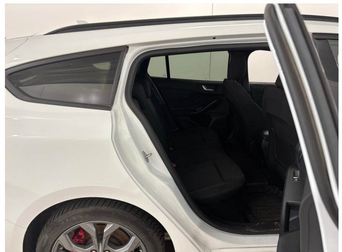
Figure 6: Interior - rear