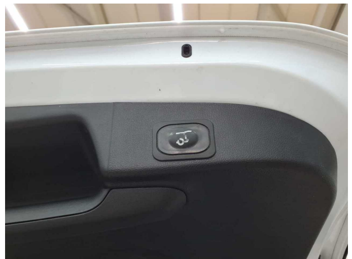
Figure 30: Misc.