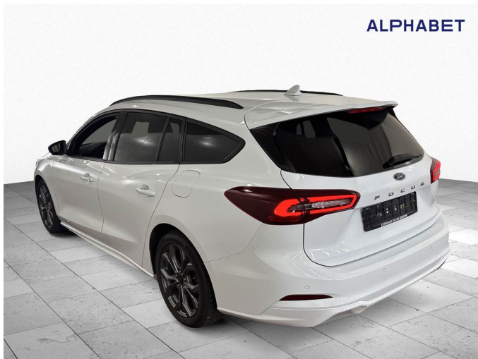
Figure 3: Diagonal rear (left)