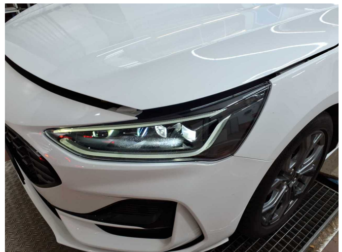
Figure 24: Misc.