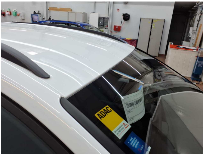
Damage 4: Roof: Roof - Stone chips - Smart repair