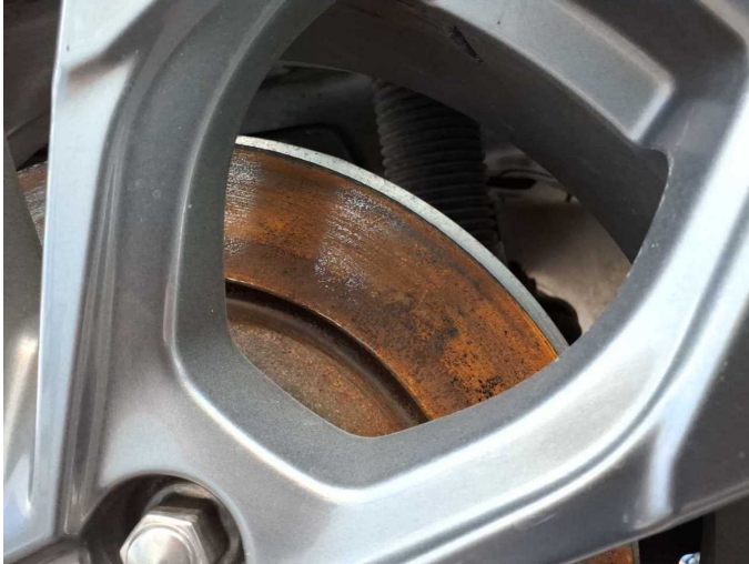
Damage 3: Braking system: Brake discs and pads - rear (Freibremsen) - Corrosion