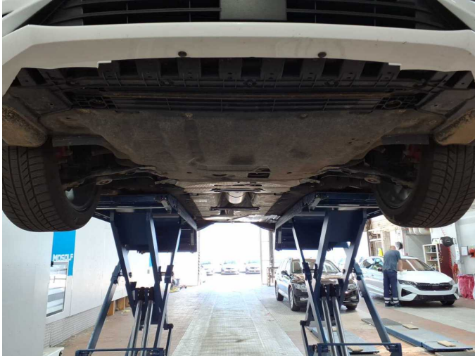
Figure 31: Misc.