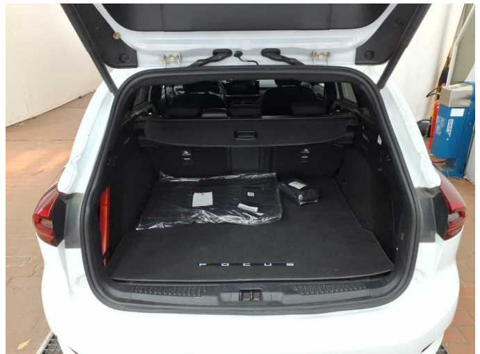
Figure 10: Cargo area