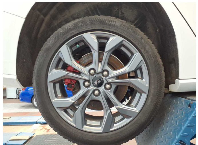
Damage 3: Braking system: Brake discs and pads - rear (Freibremse) - Corrosion