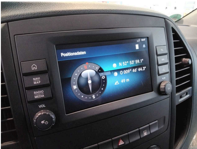
Figure 15: Navigation