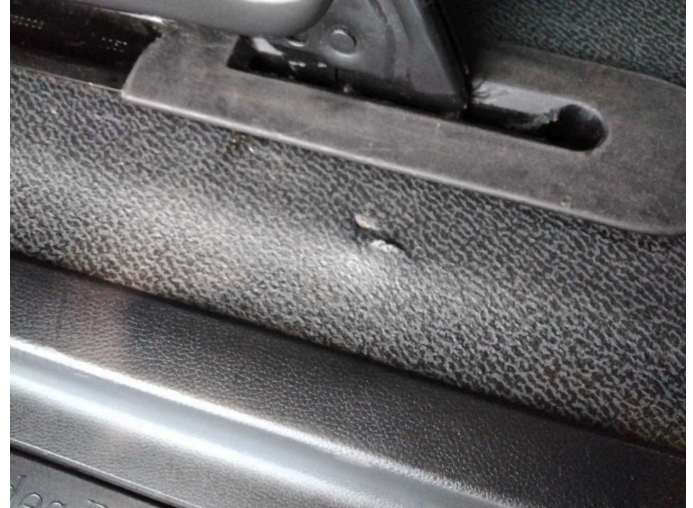
Damage 3: Trim / covers: Floor covering - front centre - Holes - Loss in value