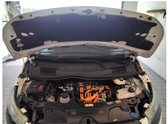
Figure 16: Misc.