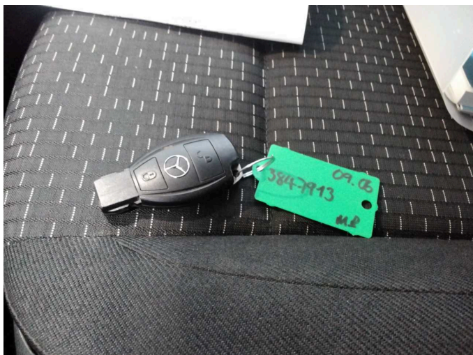
Missing part 1: Equipment: Vehicle key - Missing - Replace