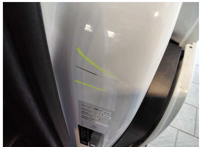
Damage 4: Body: B-pillar - left side - Scratch(es) - Smart repair