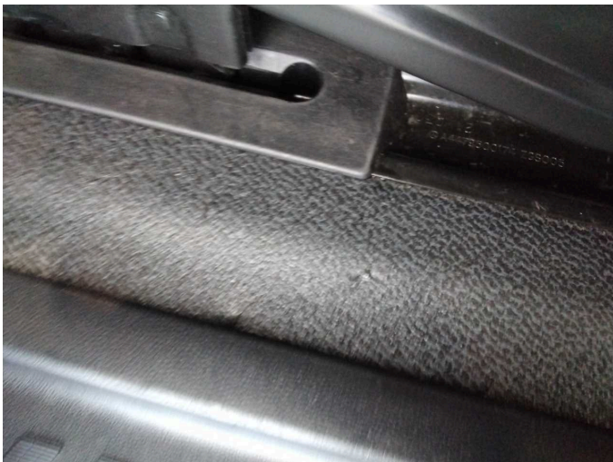
Damage 3: Trim / covers: Floor covering - front centre - Holes - Loss in value