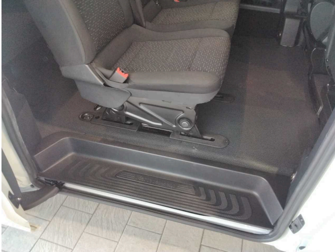
Damage 3: Trim / covers: Floor covering - front centre - Holes - Loss in value