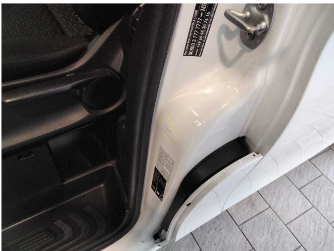
Damage 4: Body: B-pillar - left side - Scratch(es) - Smart repair