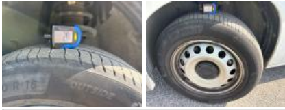
Tyre FR, Out of tolerance, Replace