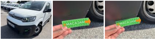
Outside rear-view mirror housing R, Scratch(es), Replace