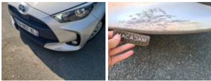
Bumper moulding FL, Unclassped, Dismount/Mount