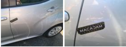
Door FL, Dent(s), Repair and paint (complete)