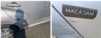
Wing RR, Dent(s) and scratch(es), Repair and paint (complete)