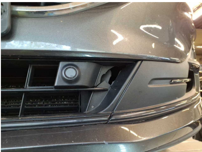
Damage 2: Front bumper: Grille - Broken / torn - Replace