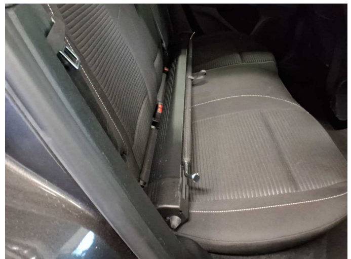
Figure 18: Misc.