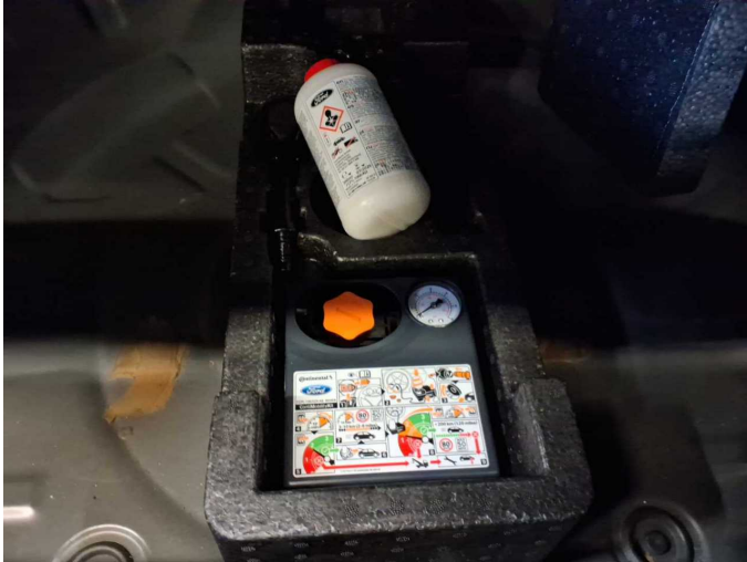
Figure 19: Misc.