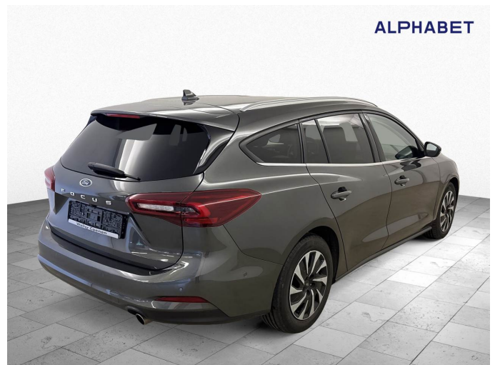
Figure 4: Diagonal rear (right)