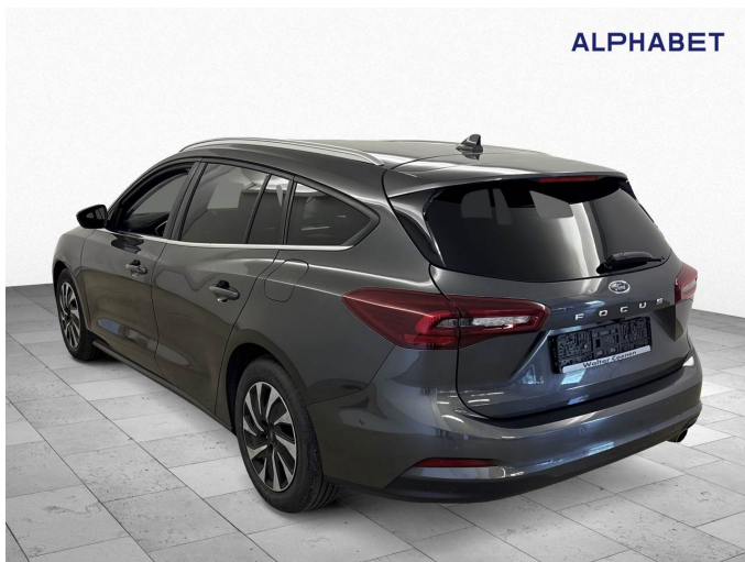
Figure 3: Diagonal rear (left)