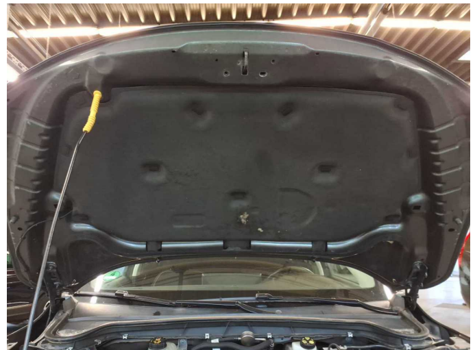
Figure 16: Misc.