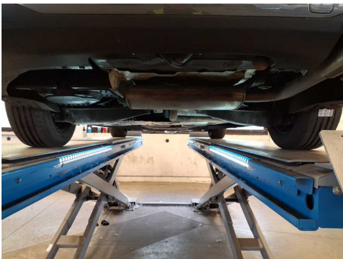
Figure 23: Misc.