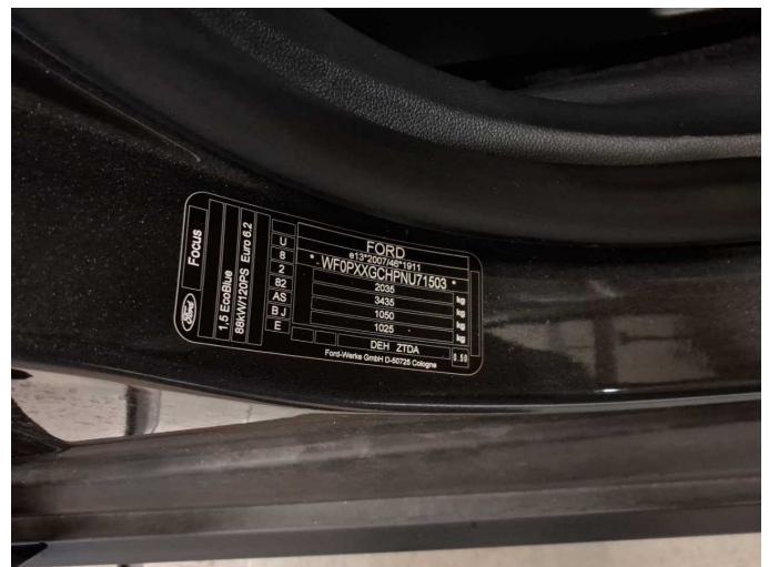
Figure 10: VIN