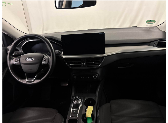
Figure 8: Instrument panel