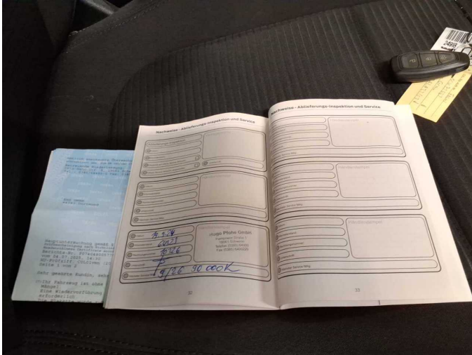
Figure 13: Documents