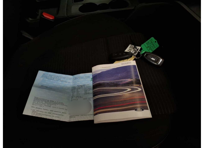
Figure 14: Documents