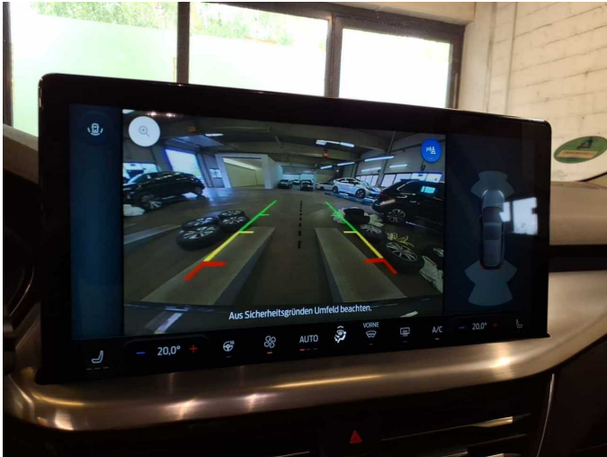
Figure 25: Misc.