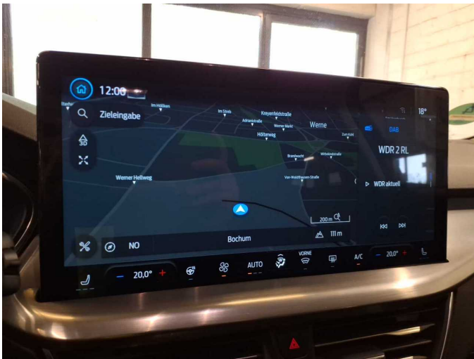
Figure 15: Navigation