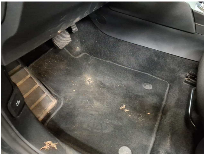
Damage 1: Trim / covers: Floor mats (VL) - Holes - Replace