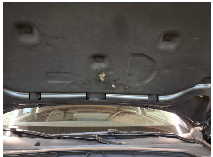
Damage 3: Bonnet: Insulation lining - Damage caused by marten / rodent - Replace