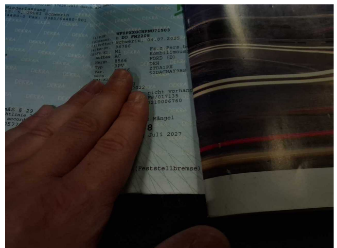
Figure 12: Documents