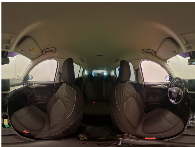
Figure 9: Interior 360° view