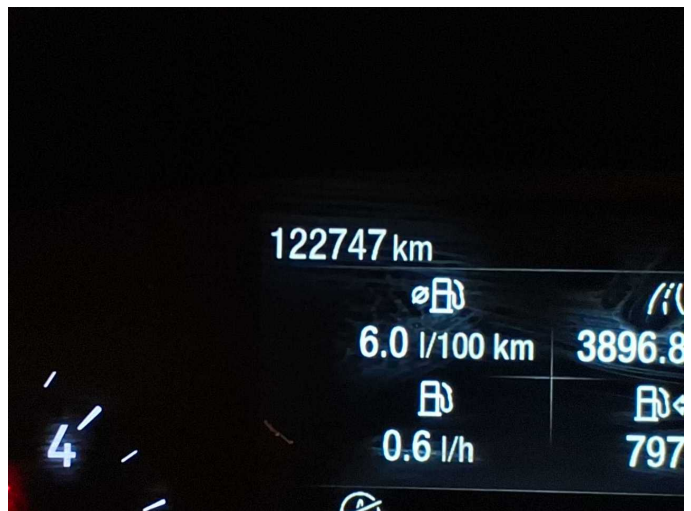
Figure 24: Misc.