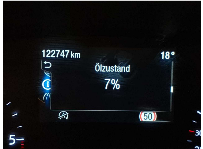
Figure 26: Misc.