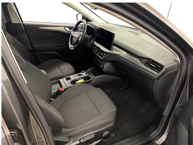
Figure 5: Interior - front