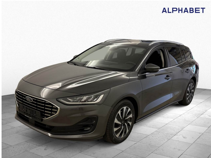
Figure 1: Diagonal front (left)