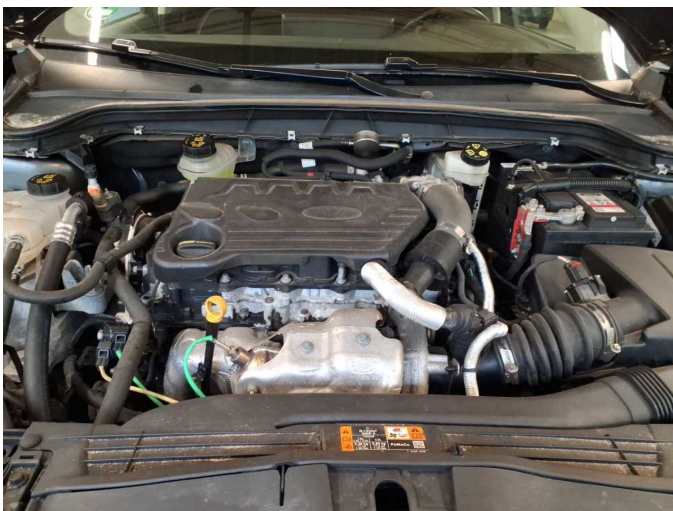
Figure 17: Misc.