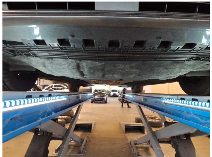
Figure 22: Misc.