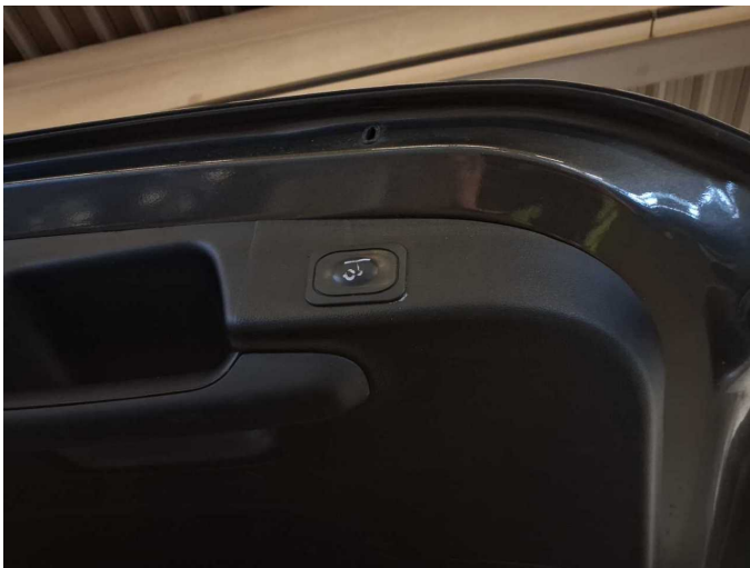
Figure 21: Misc.