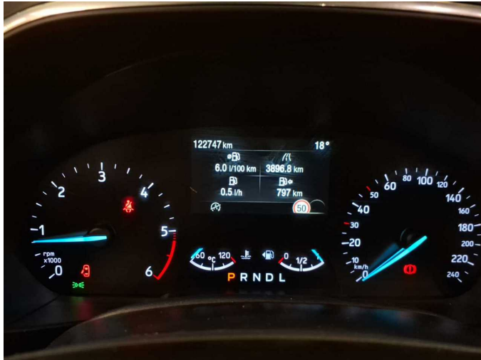
Figure 7: Instrument cluster