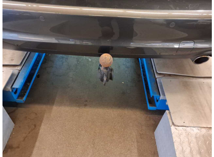
Figure 20: Misc.