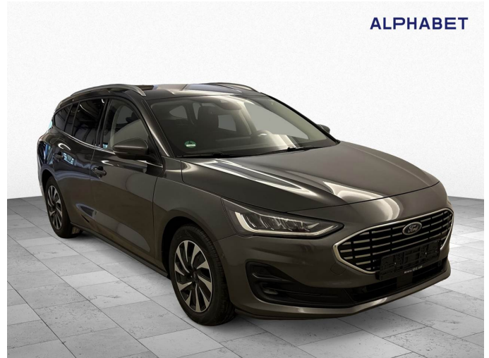
Figure 2: Diagonal front (right)