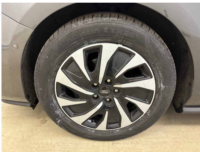
Figure 11: Mounted tyres