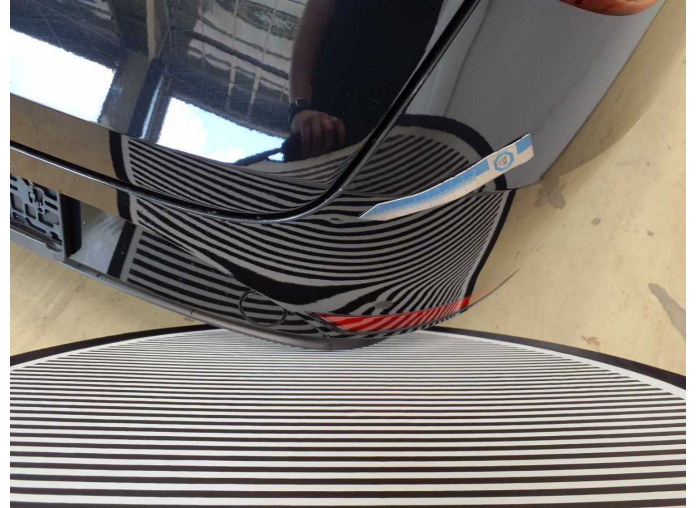
Damage 2: Rear bumper: Rear bumper - dent(s) - Smart repair