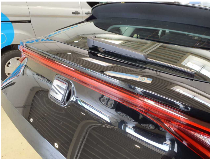
Damage 3: Boot lid / rear door: Boot lid - Scratch(es) - Smart repair