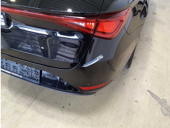
Damage 2: Rear bumper: Rear bumper - dent(s) - Smart repair