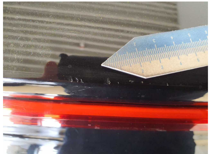
Damage 3: Boot lid / rear door: Boot lid - Scratch(es) - Smart repair