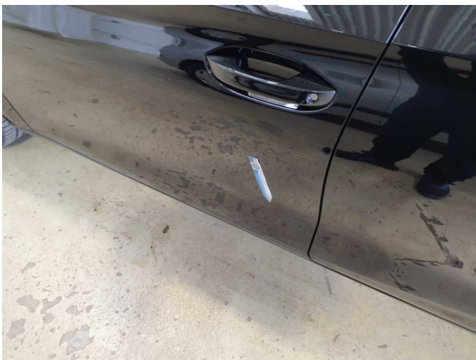
Damage 4: Door - front left side: Door - Scratch(es) - Smart repair