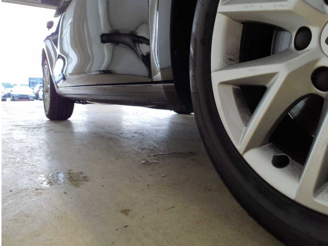
Figure 25: Misc.