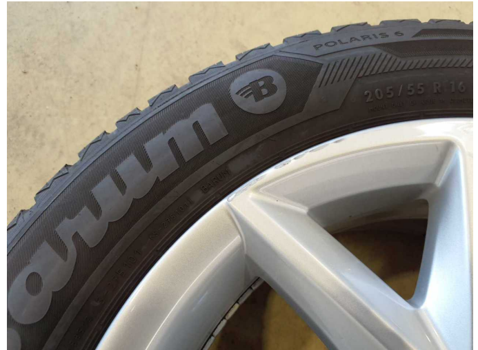
Wear and tear 4: 2nd wheel set: 1 alloy rim (Winterradsatz gehört nicht zur Ausstattung) - Scratch(es) - No deduction