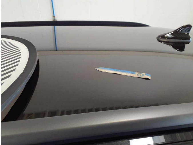
Damage 5: Roof: Roof (Anätzung) - Paint defect - Repair and paint