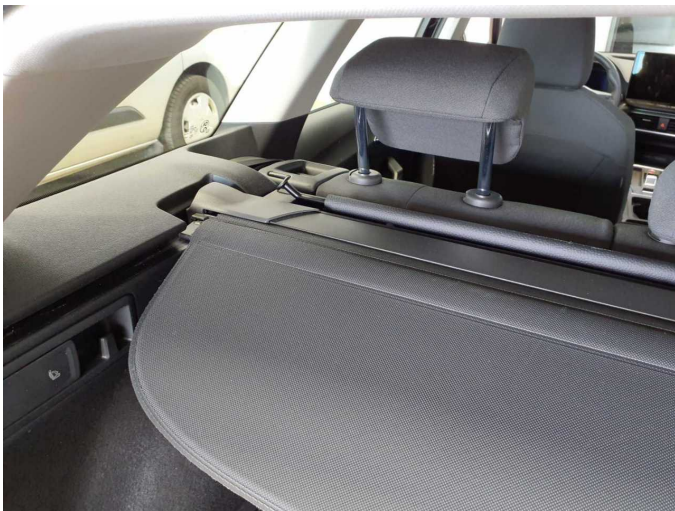
Figure 27: Misc.