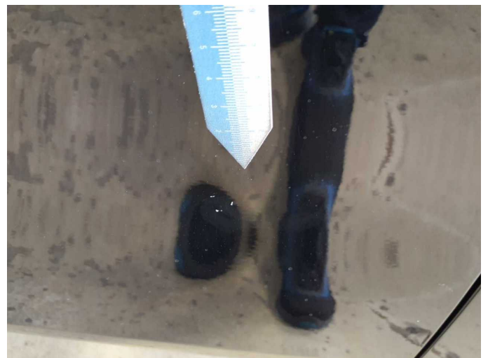
Damage 4: Door - front left side: Door - Scratch(es) - Smart repair