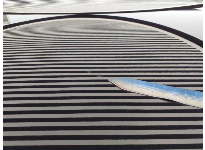
Damage 5: Roof: Roof (Anätzung) - Paint defect - Repair and paint