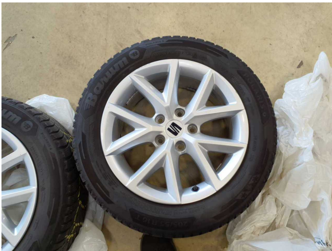
Figure 15: Additional tyres