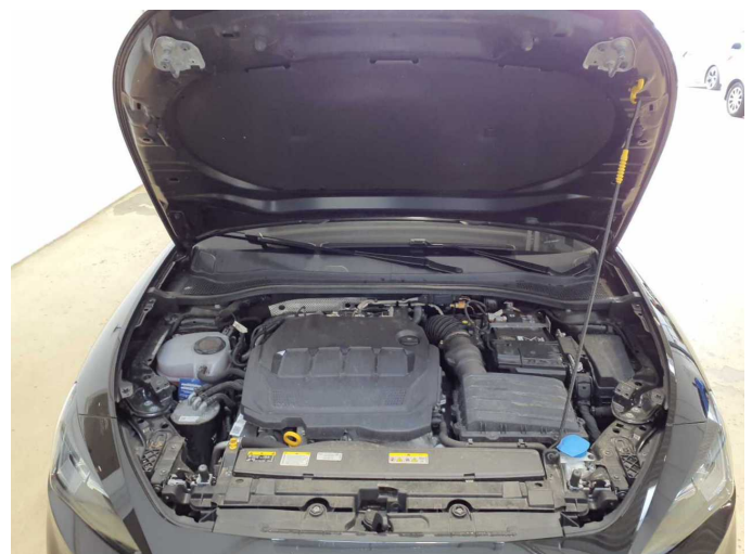
Figure 24: Misc.