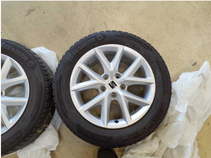
Wear and tear 4: 2nd wheel set: 1 alloy rim (Winterradsatz gehört nicht zur Ausstattung) - Scratch(es) - No deduction