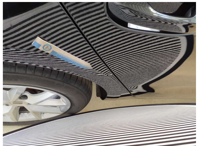
Damage 1: Side panel - rear right side: Side panel - dent(s) - Smooth repair work