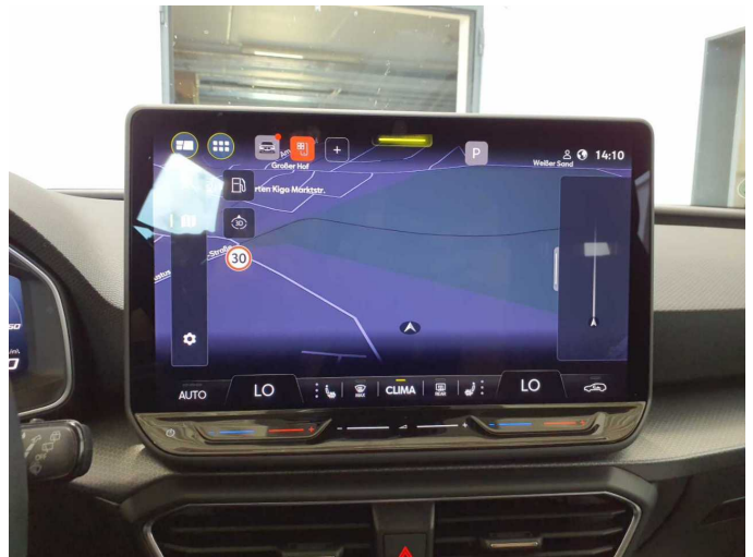
Figure 16: Navigation