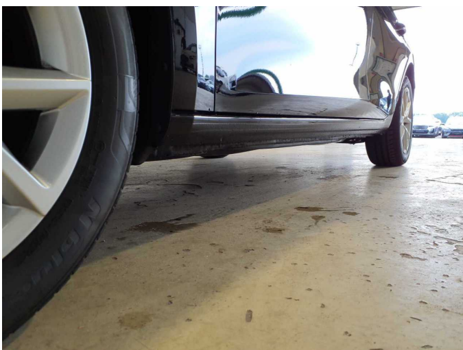
Figure 23: Misc.