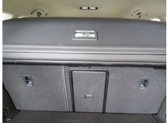
Figure 26: Misc.