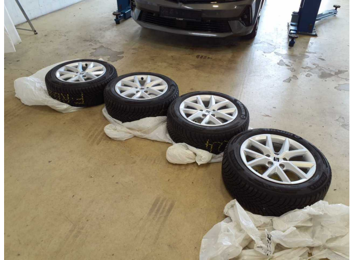
Figure 14: Additional tyres