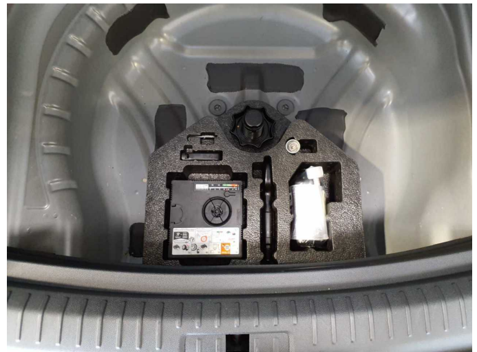
Figure 28: Misc.