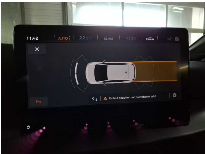
Figure 17: Misc.