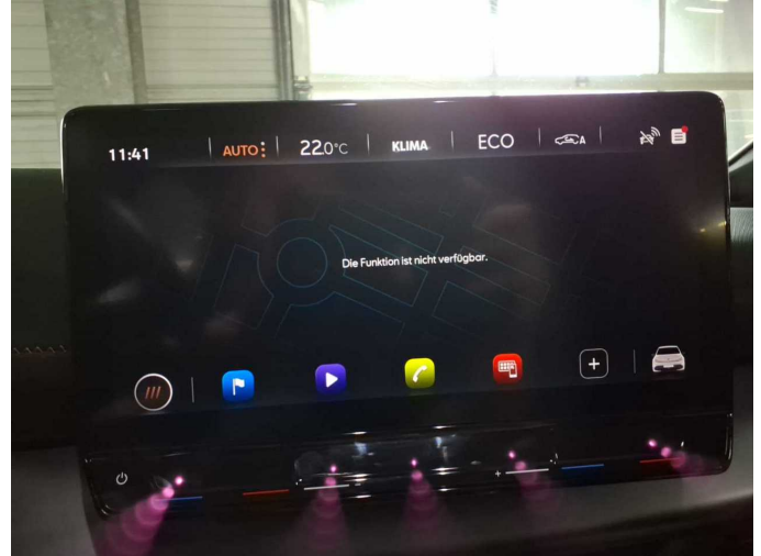
Figure 14: Navigation