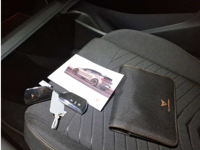
Figure 13: Documents