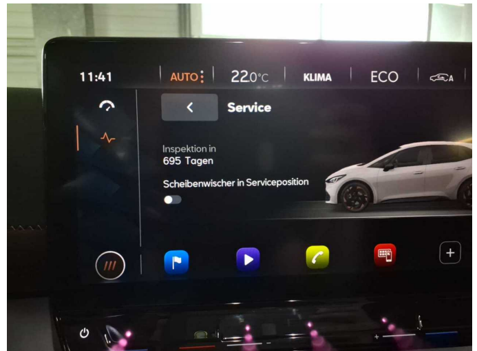
Figure 16: Misc.