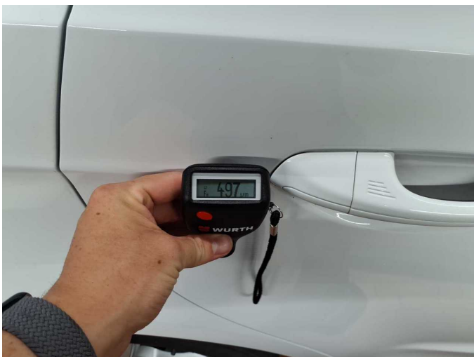
Repainting 1: Door - rear right side