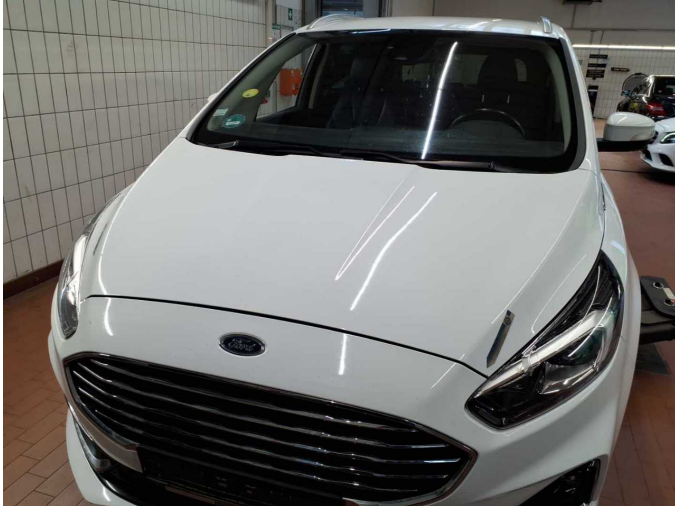
Damage 7: Bonnet: Bonnet - Stone chips - Paint