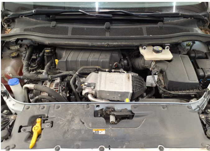
Figure 15: Misc.