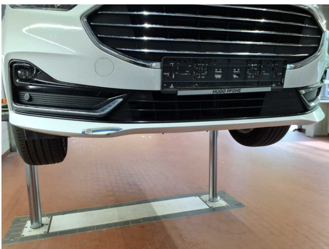
Damage 6: Front bumper: Spoiler - Scratch(es) - Smart repair