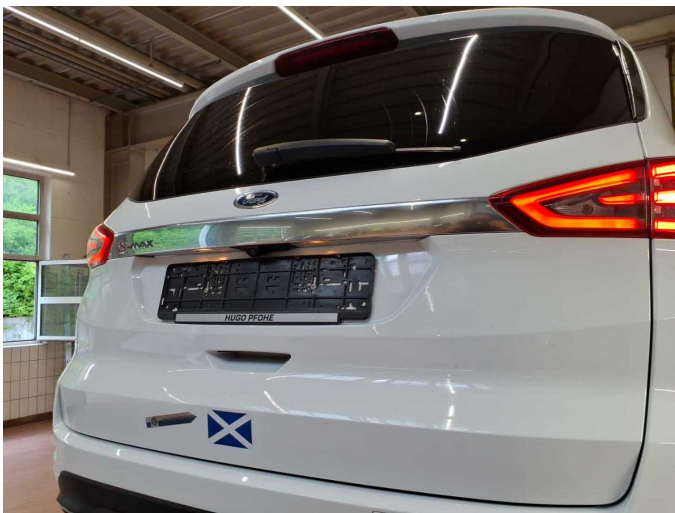
Damage 4: Boot lid / rear door: Boot lid - Glued / labelled - De-glue / neutralise