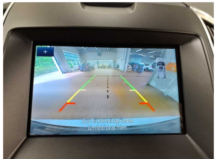
Figure 24: Misc.