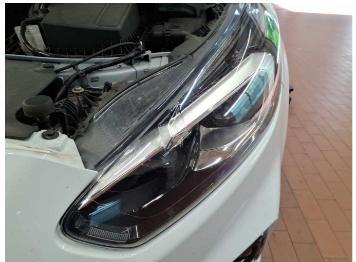
Figure 16: Misc.