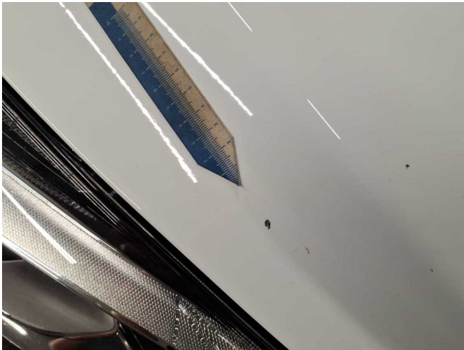
Damage 7: Bonnet: Bonnet - Stone chips - Paint