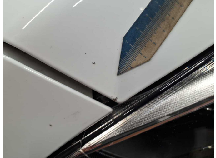
Damage 7: Bonnet: Bonnet - Stone chips - Paint