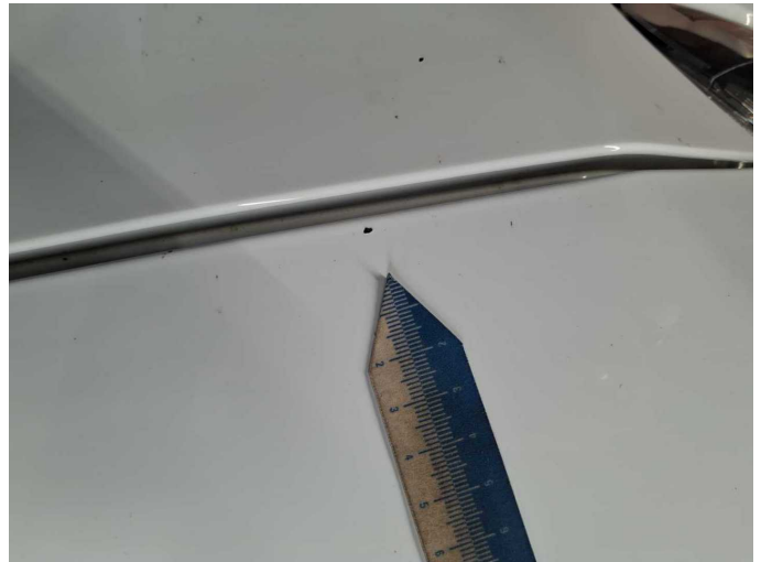
Damage 7: Bonnet: Bonnet - Stone chips - Paint