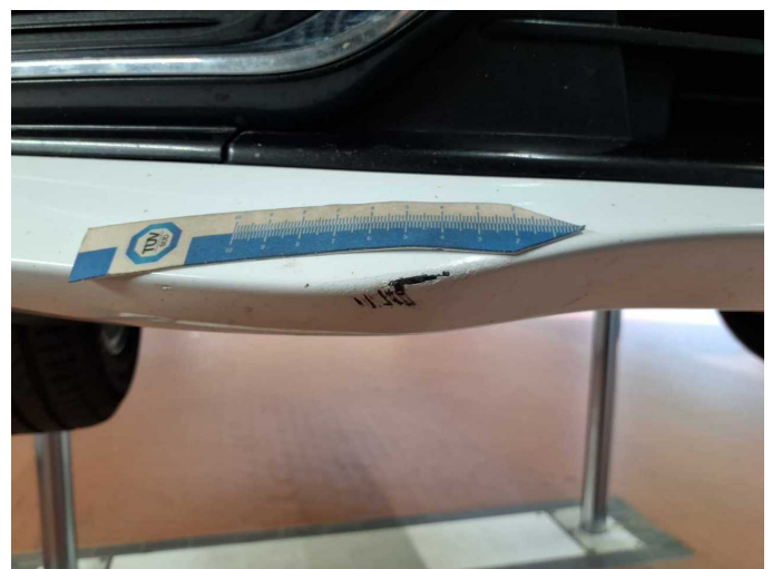
Damage 6: Front bumper: Spoiler - Scratch(es) - Smart repair