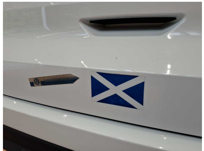
Damage 4: Boot lid / rear door: Boot lid - Glued / labelled - De-glue / neutralise