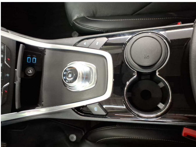
Figure 23: Misc.