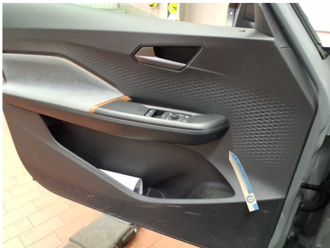
Wear and tear 1: Trim / covers: Door trim - front left side - Scratch(es) - No deduction