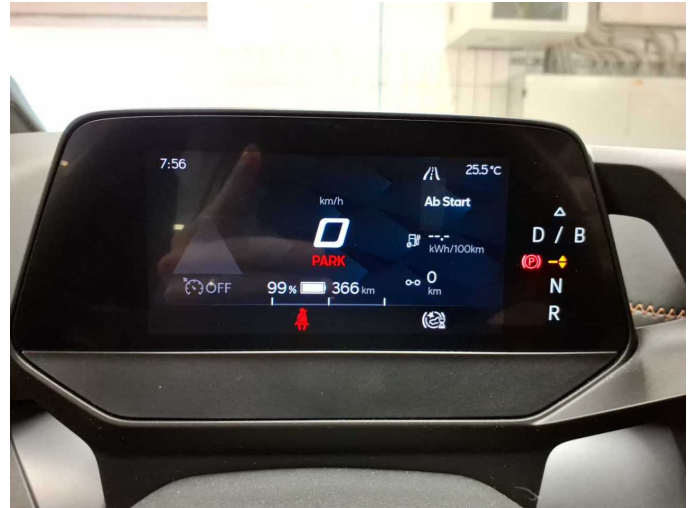
Figure 14: Documents