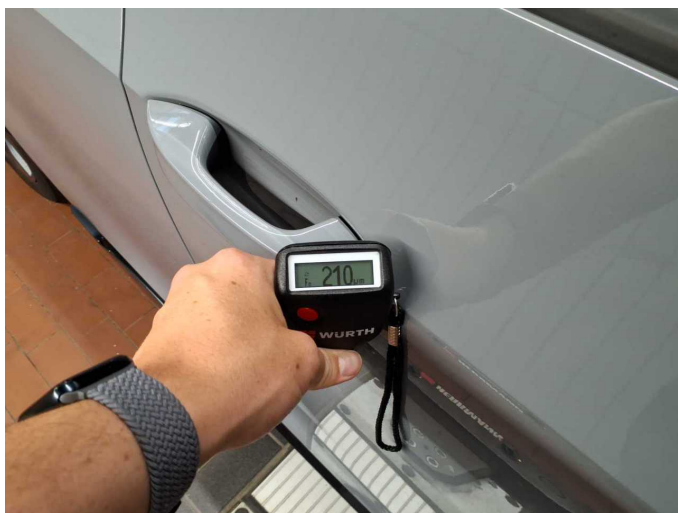
Repainting 2: Door - front right side