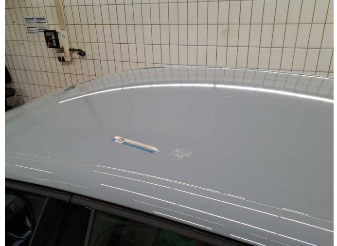
Damage 1: Roof: Roof (Verätzung - Mehrkosten können entstehen) - Soiled - Conditioning