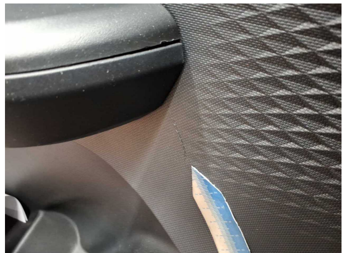
Wear and tear 1: Trim / covers: Door trim - front left side - Scratch(es) - No deduction