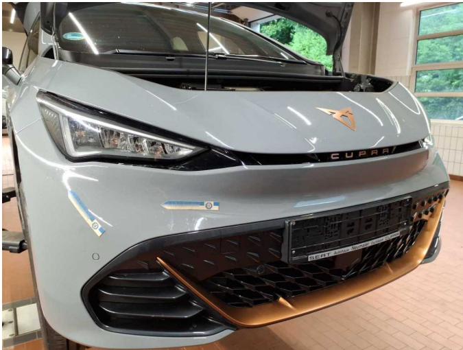
Damage 2: Front bumper: Front bumper - Scratch(es) - Paint