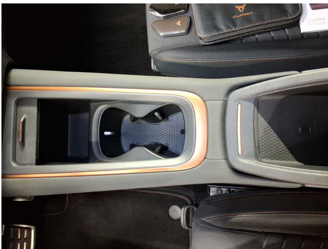
Figure 29: Misc.