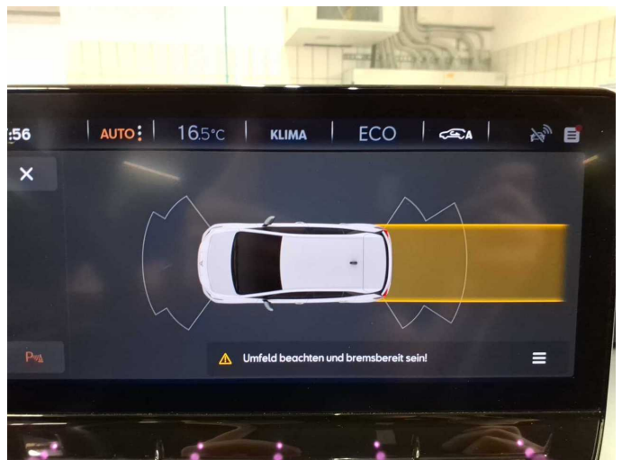
Figure 30: Misc.