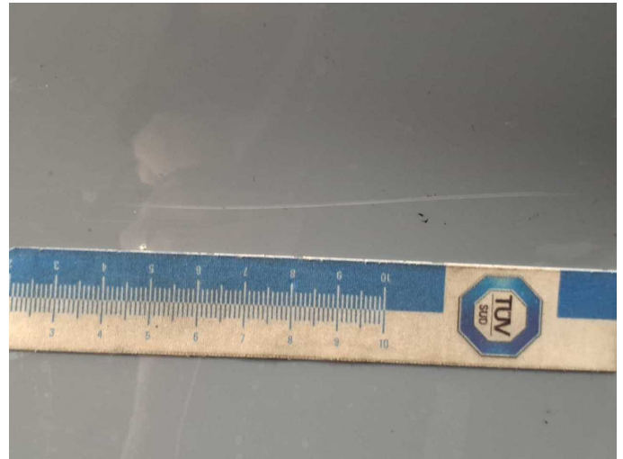
Damage 2: Front bumper: Front bumper - Scratch(es) - Paint