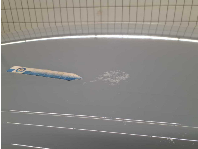
Damage 1: Roof: Roof (Verätzung - Mehrkosten können entstehen) - Soiled - Conditioning