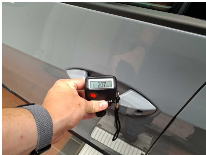
Repainting 1: Door - front left side