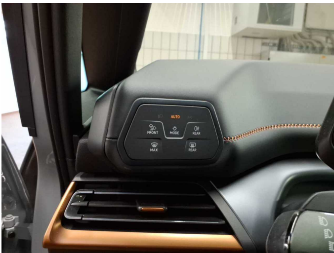
Figure 27: Misc.