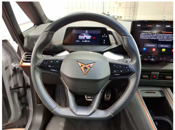
Figure 28: Misc.