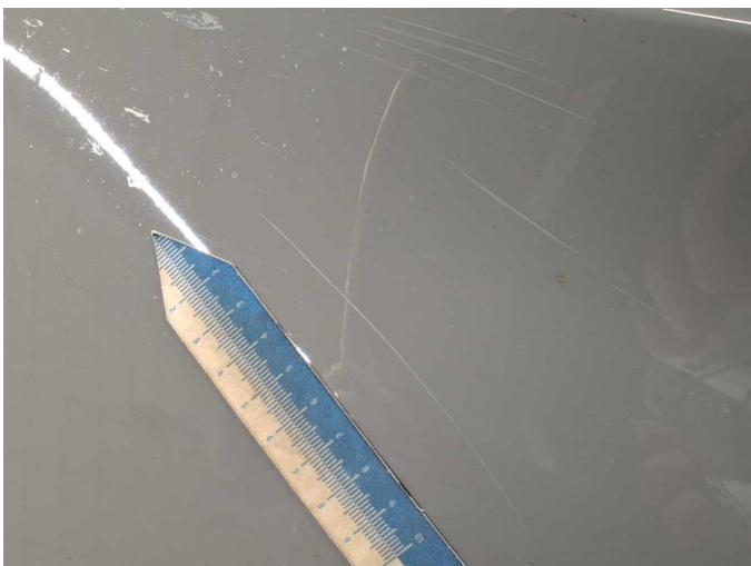
Damage 2: Front bumper: Front bumper - Scratch(es) - Paint