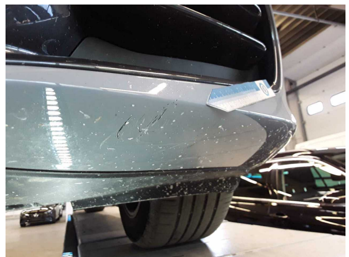
Damage 2: Front bumper: Front bumper - Scratched - Paint