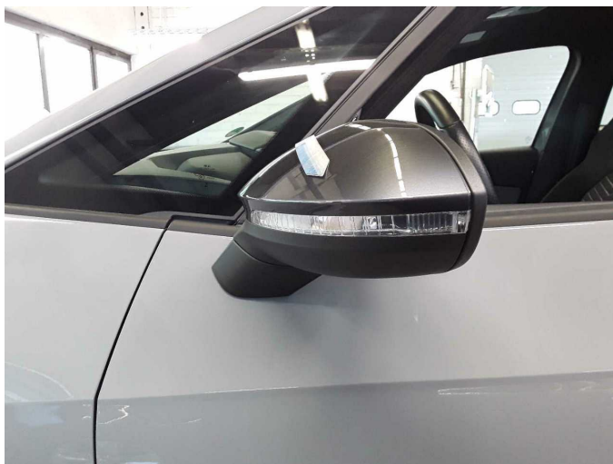
Damage 1: Wing mirror - left side: Cap - Scratch(es) - Smart repair