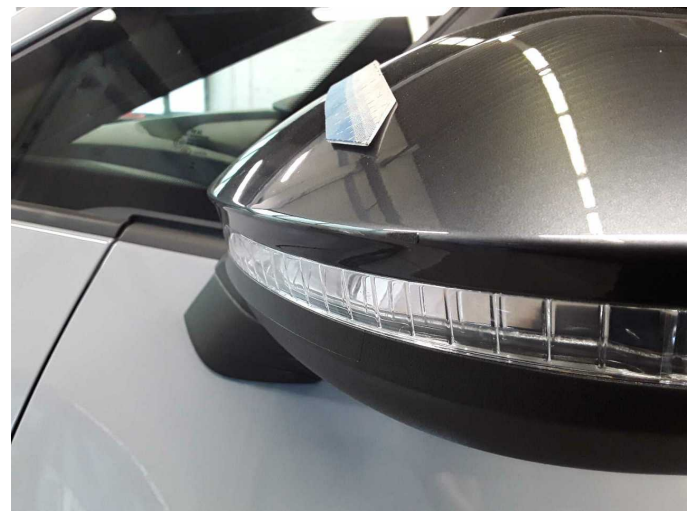
Damage 1: Wing mirror - left side: Cap - Scratch(es) - Smart repair