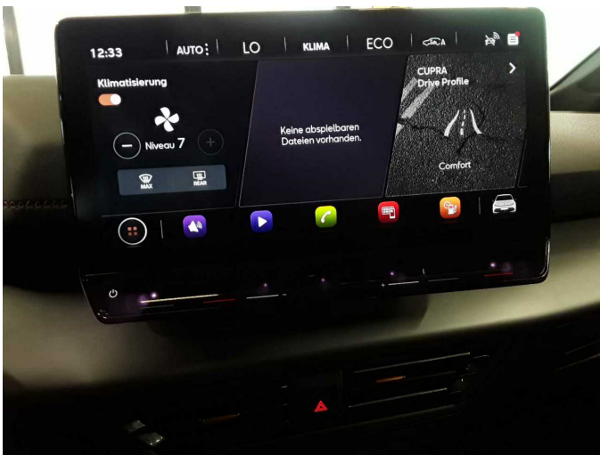
Figure 15: Navigation