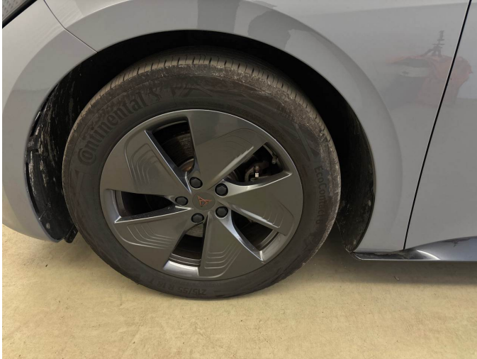
Figure 13: Mounted tyres