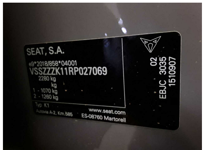
Figure 12: VIN