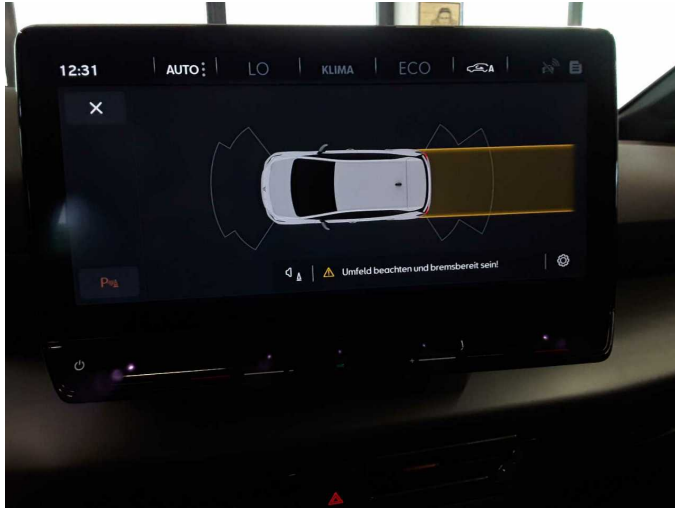
Figure 25: Misc.