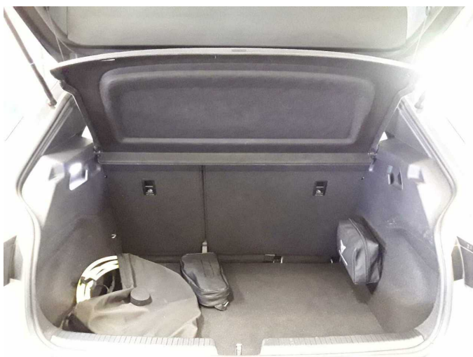
Figure 11: Cargo area