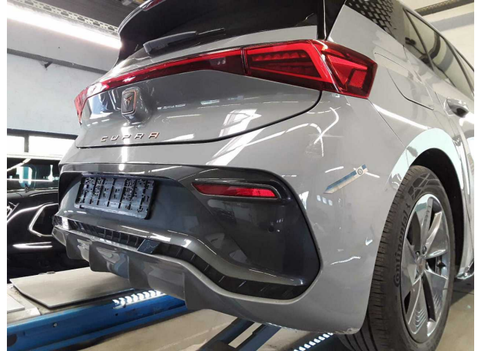
Damage 3: Rear bumper: Rear bumper - Scratched - Paint