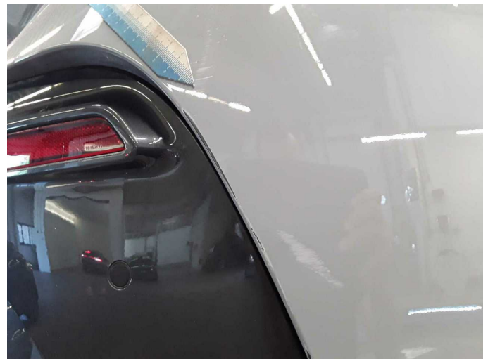
Damage 3: Rear bumper: Rear bumper - Scratched - Paint