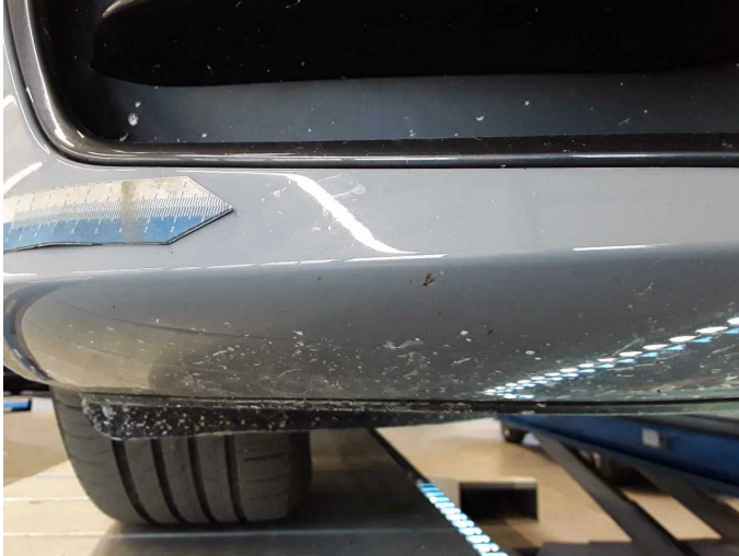
Damage 2: Front bumper: Front bumper - Scratched - Paint