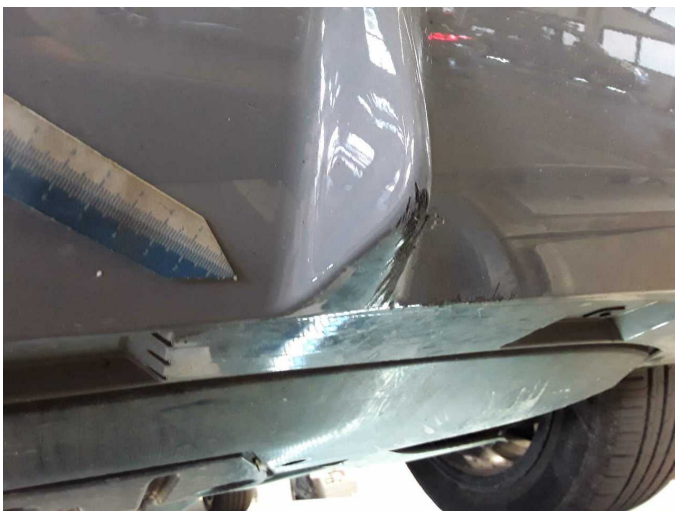
Damage 3: Rear bumper: Rear bumper - Scratched - Paint