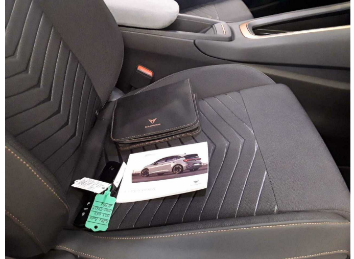
Figure 14: Documents