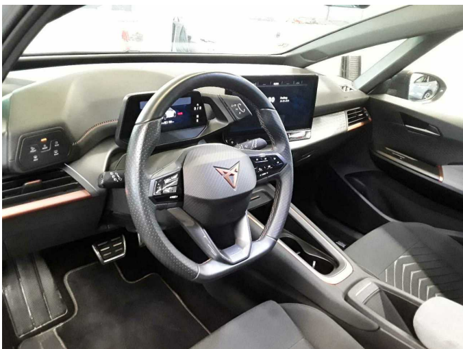
Figure 23: Misc.