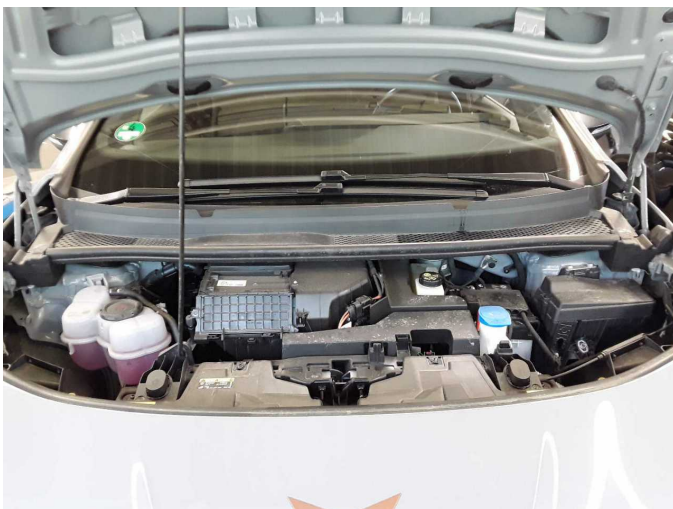
Figure 17: Misc.