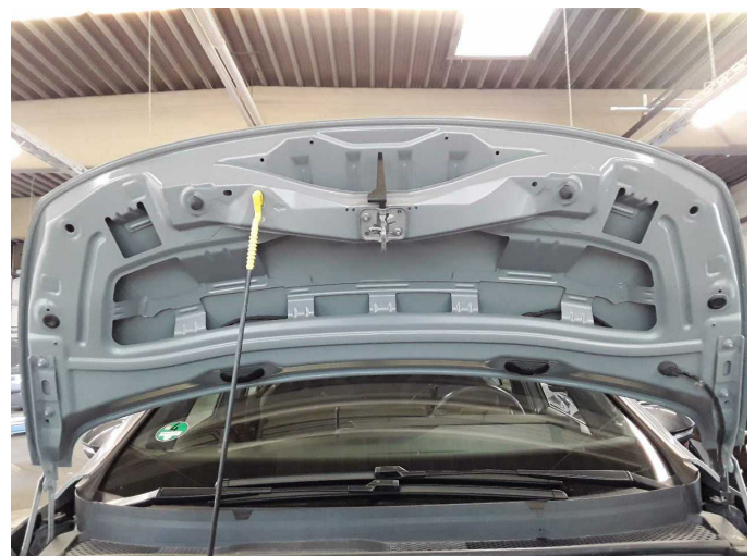
Figure 16: Misc.