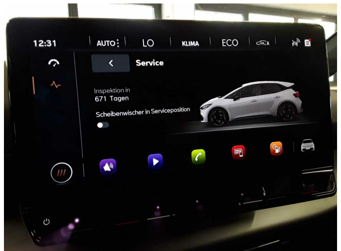
Figure 24: Misc.