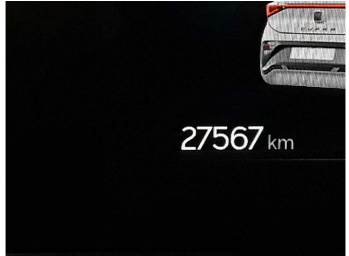
Figure 26: Misc.