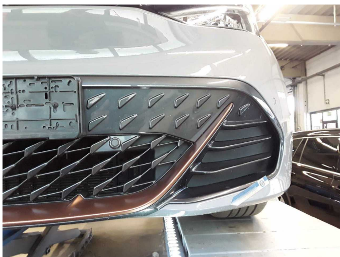
Damage 2: Front bumper: Front bumper - Scratched - Paint