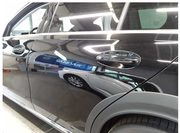
Damage 1: Door - rear left side: Door - dent(s) - Smooth repair work