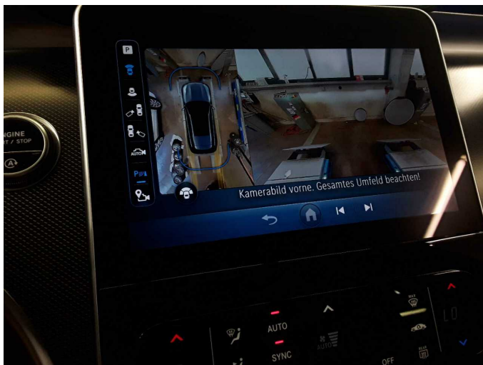
Figure 33: Misc.