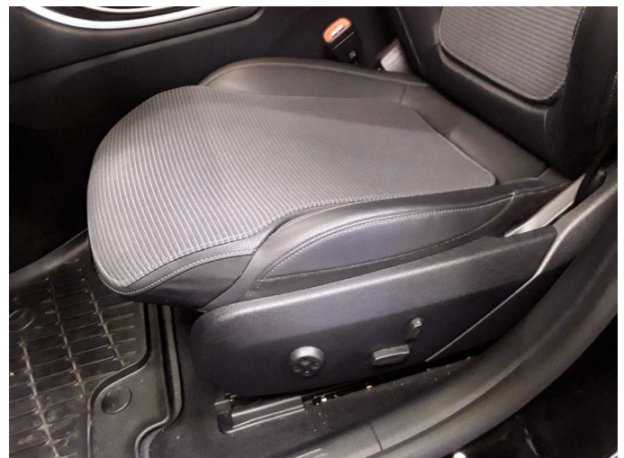
Figure 24: Misc.