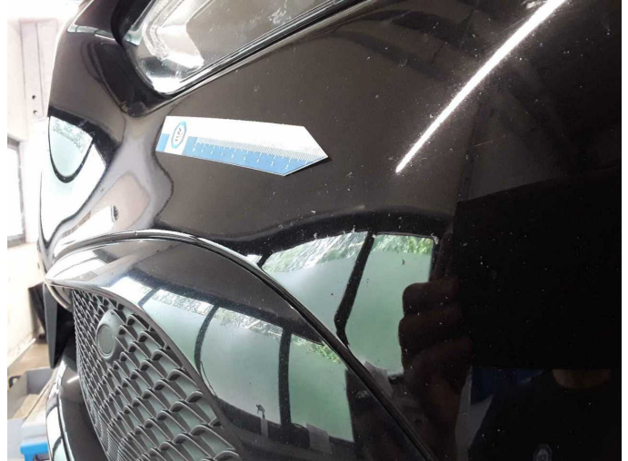
Wear and tear 2: Front bumper: Front bumper - Stone chips - No deduction