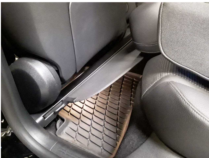
Figure 23: Misc.