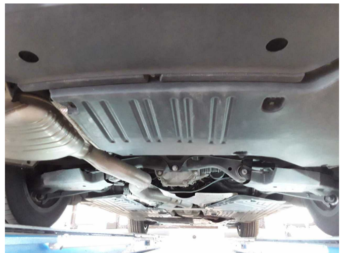
Figure 30: Misc.