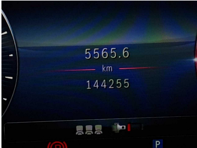
Figure 31: Misc.