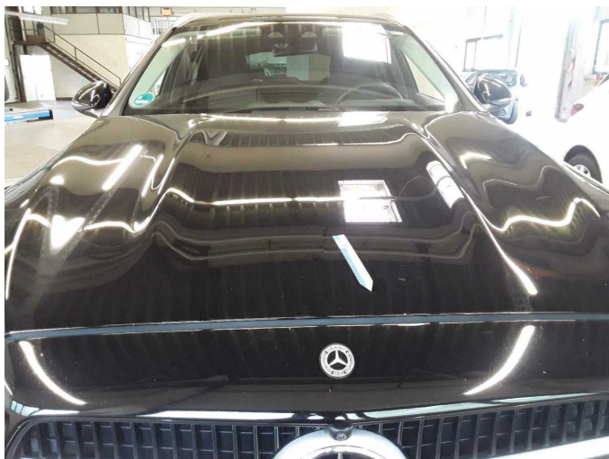
Wear and tear 1: Bonnet: Bonnet - Stone chips - No deduction