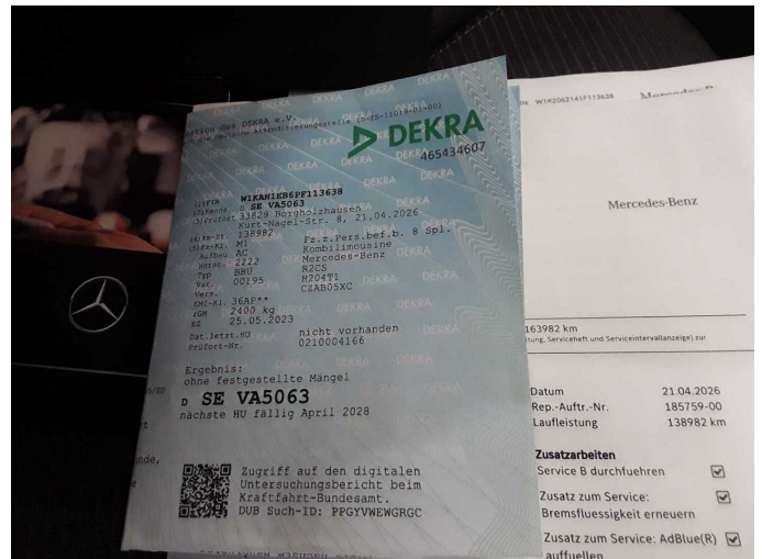
Figure 16: Documents