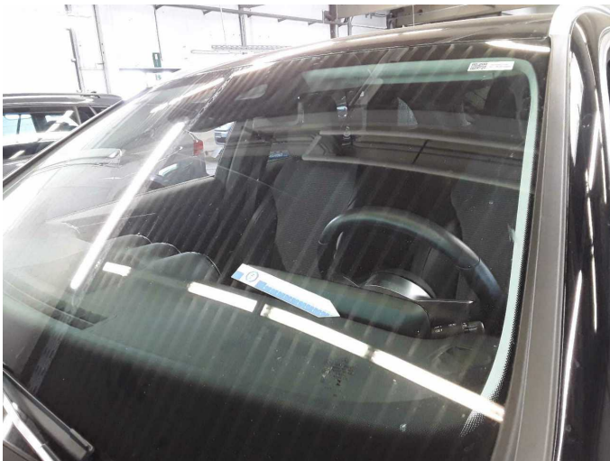
Wear and tear 3: Vehicle glazing: Windscreen - Stone chips - No deduction