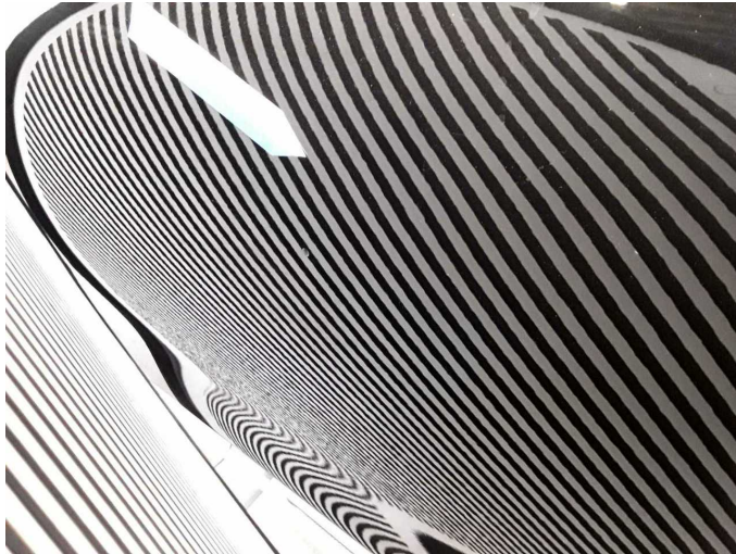
Damage 1: Door - rear left side: Door - dent(s) - Smooth repair work