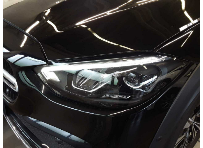
Figure 26: Misc.