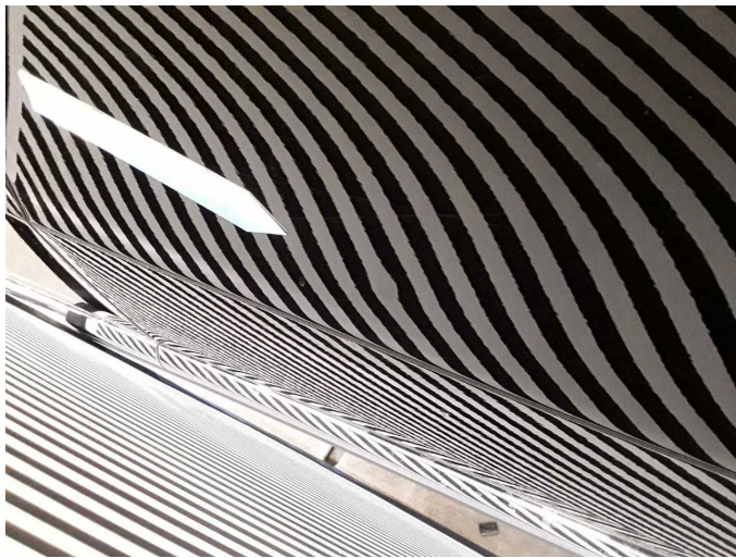
Damage 2: Door - front right side: Door - Dent / paintcoat damage - Repair and paint