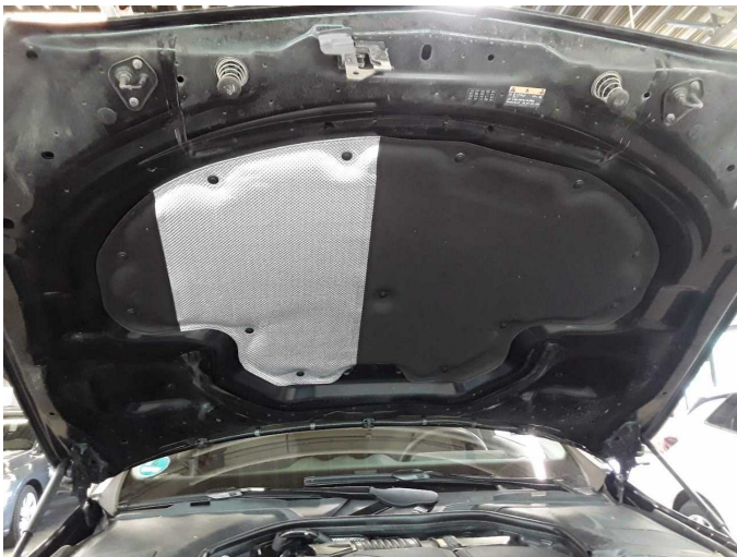
Figure 27: Misc.