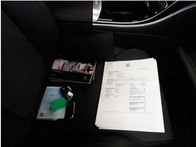
Figure 13: Documents