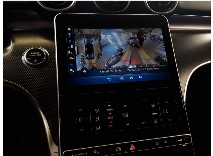
Figure 32: Misc.