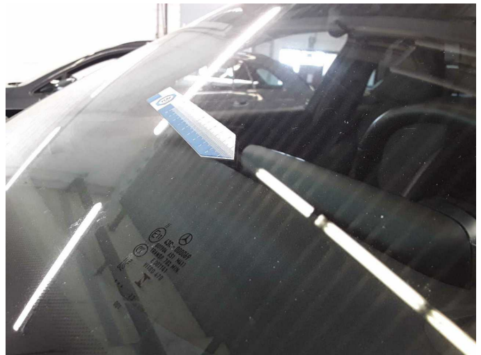
Wear and tear 3: Vehicle glazing: Windscreen - Stone chips - No deduction