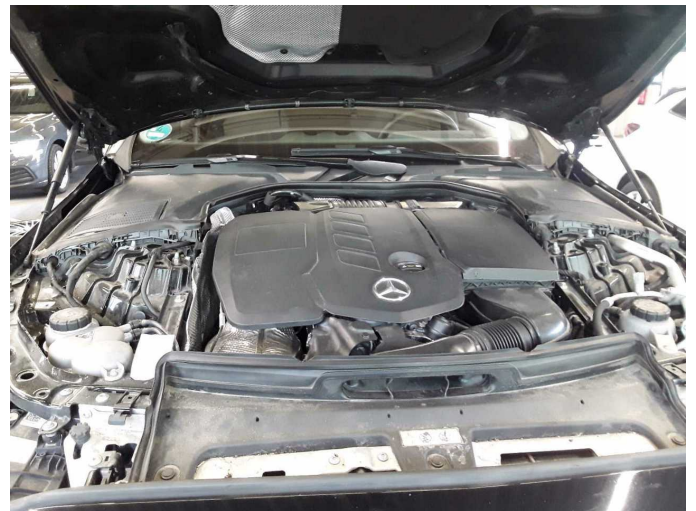
Figure 28: Misc.