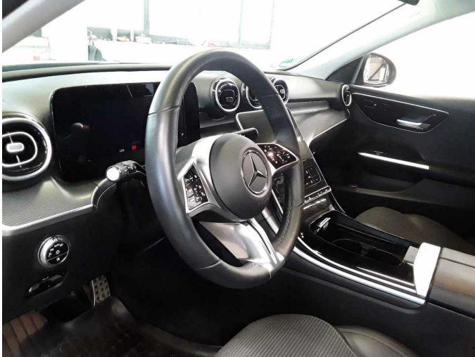
Figure 25: Misc.