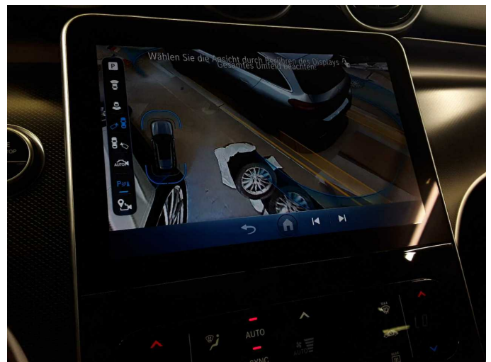
Figure 34: Misc.