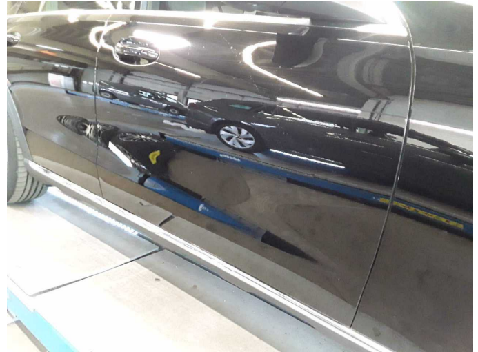
Damage 2: Door - front right side: Door - Dent / paintcoat damage - Repair and paint