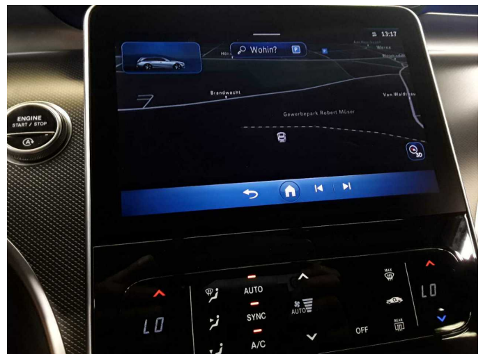
Figure 18: Navigation