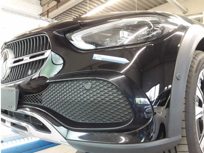
Wear and tear 2: Front bumper: Front bumper - Stone chips - No deduction