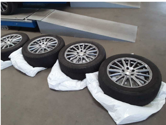
Figure 17: Additional tyres