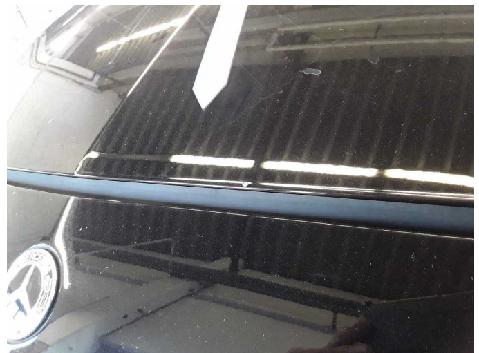
Wear and tear 1: Bonnet: Bonnet - Stone chips - No deduction