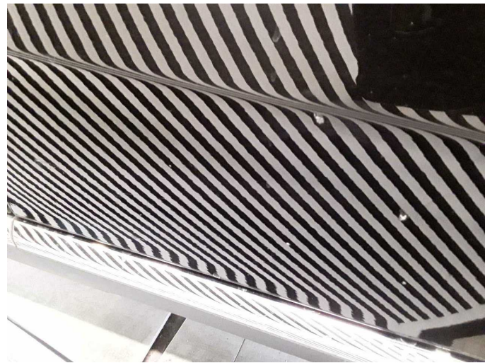
Damage 2: Door - front right side: Door - Dent / paintcoat damage - Repair and paint