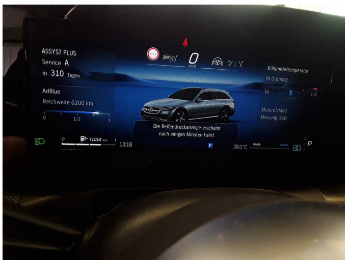
Figure 35: Misc.