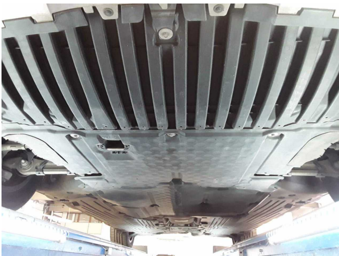
Figure 29: Misc.