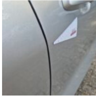
Damage Type Door-edge chipped