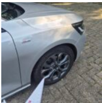
Damage Part Alloy - Right Front