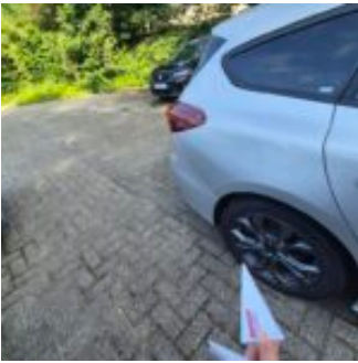
Damage Part Alloy - Right Rear