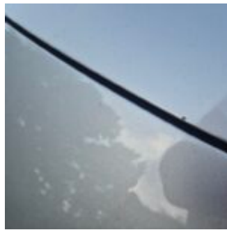
Damage Type Stonechipping