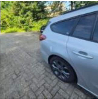
Damage Part Fender - Rear Right