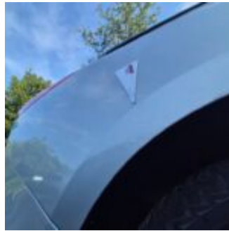
Damage Type Scratch(es)