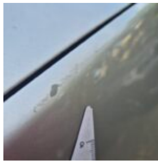
Damage Type Scratch(es)