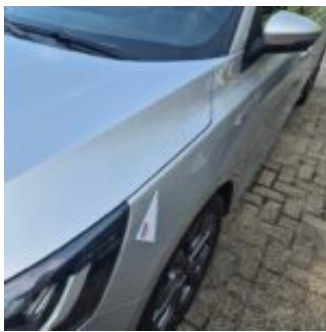
Damage Part Fender - Front Left