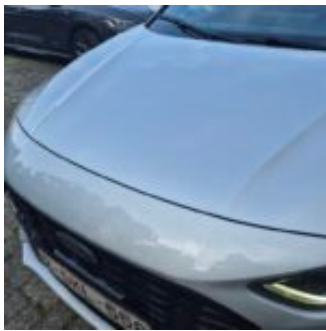
Damage Part Hood