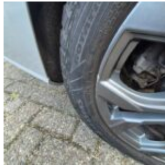
Damage Type Damaged