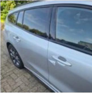
Damage Part Frontdoor - Right