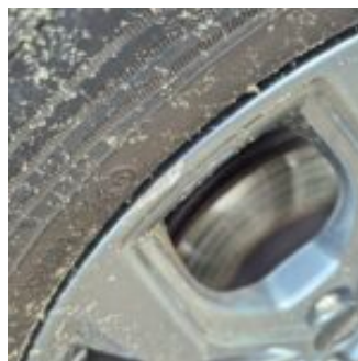
Damage Type Damaged