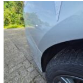
Repair Type Spray