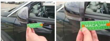
Door RL, Scratch(es), Paint