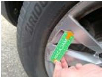
Alloy rim FR, Scratch(es), Acceptable