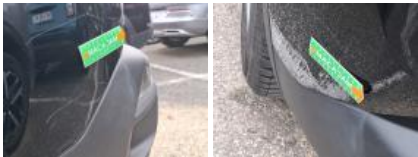
Bumper corner RR, Scratch(es), Acceptable