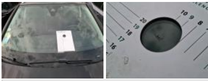
Windscreen glue kit, Required to install glazing, Repair/replace (lump sum)