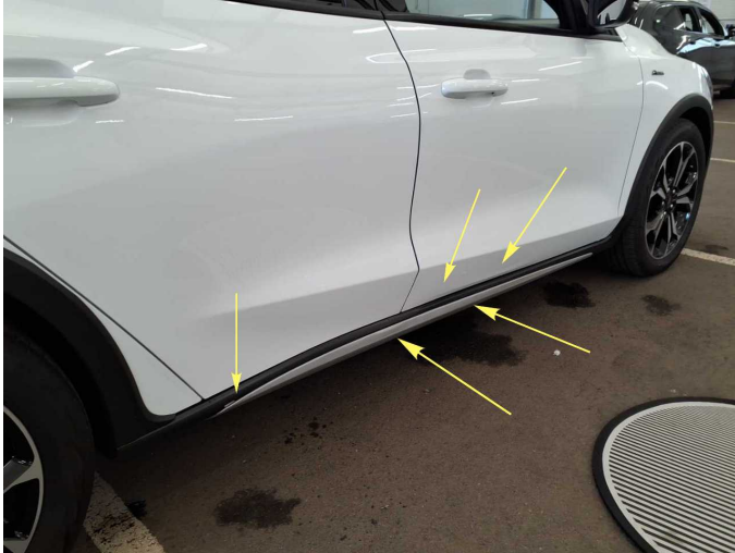
Accident 1: Side right