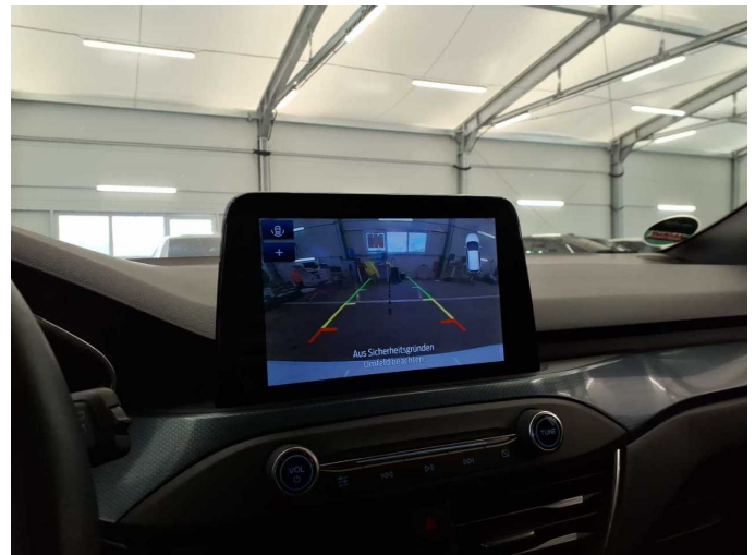
Figure 18: Misc.