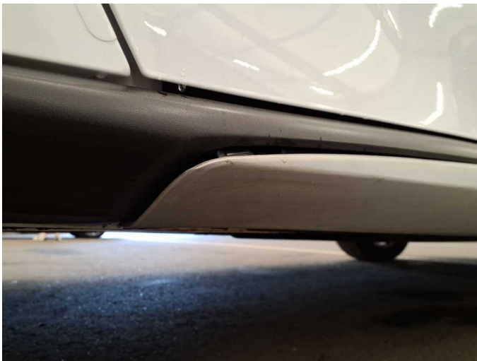
Accident 1: Side right