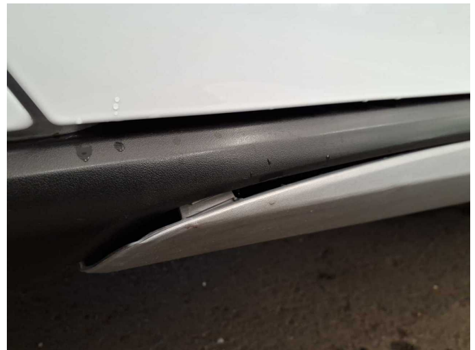
Accident 1: Side right