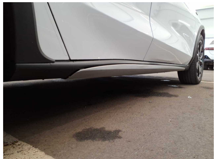
Figure 24: Misc.