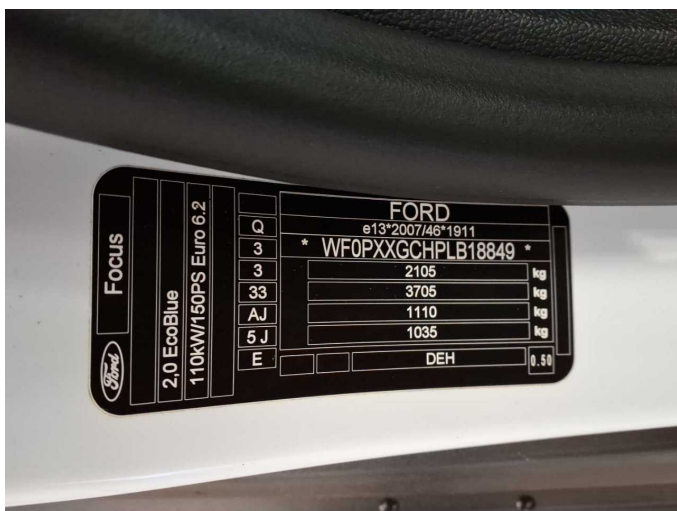
Figure 11: VIN