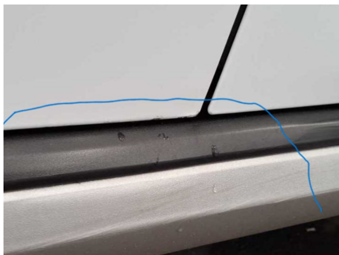
Accident 1: Side right