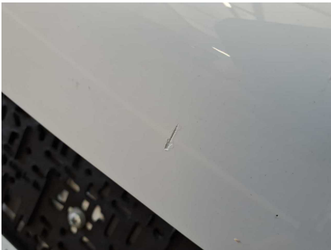
Damage 3: Boot lid / rear door: Boot lid - Scratch(es) - Smart repair