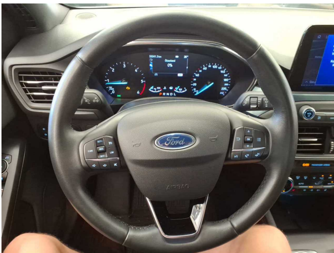
Figure 23: Misc.