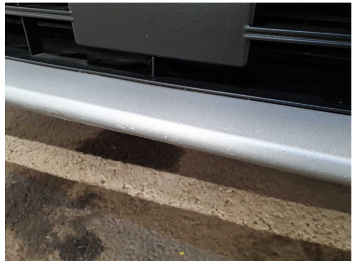
Damage 1: Front bumper: Spoiler - Scratch(es) - Loss in value