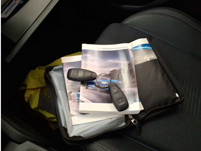
Figure 13: Documents