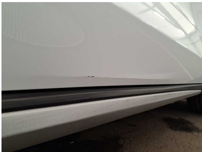
Accident 1: Side right