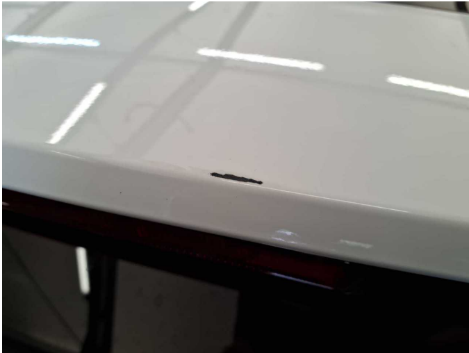
Damage 2: Boot lid / rear door: Rear spoiler - Scratch(es) - Smart repair