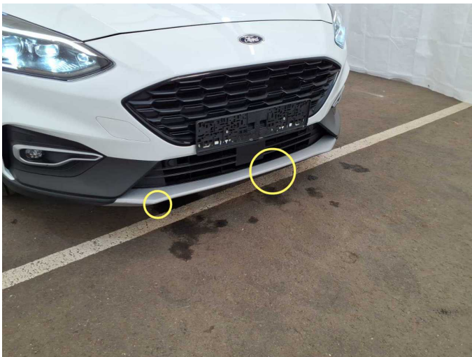
Damage 1: Front bumper: Spoiler - Scratch(es) - Loss in value