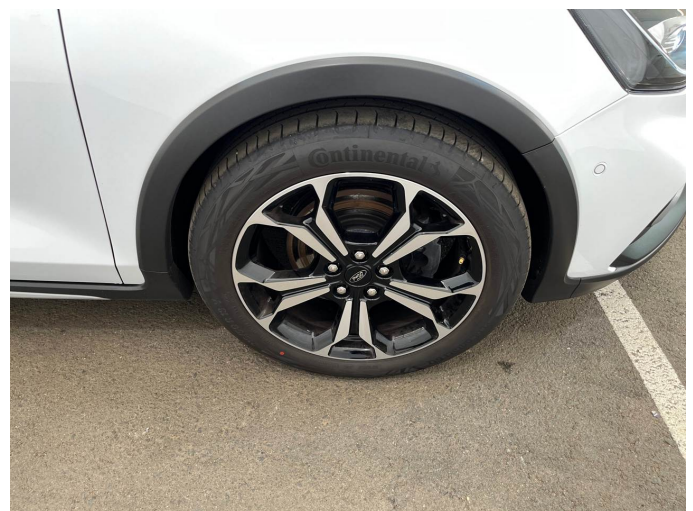
Figure 12: Mounted tyres