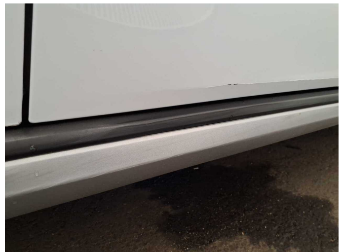
Accident 1: Side right