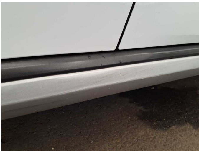
Accident 1: Side right