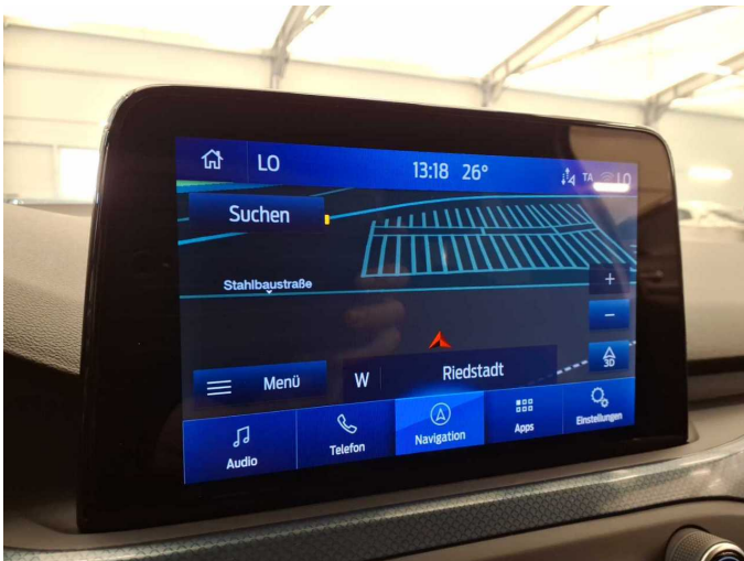
Figure 17: Navigation