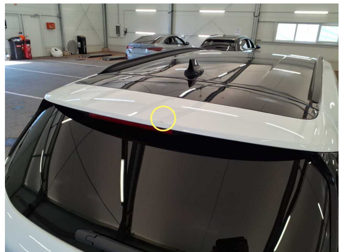
Damage 2: Boot lid / rear door: Rear spoiler - Scratch(es) - Smart repair