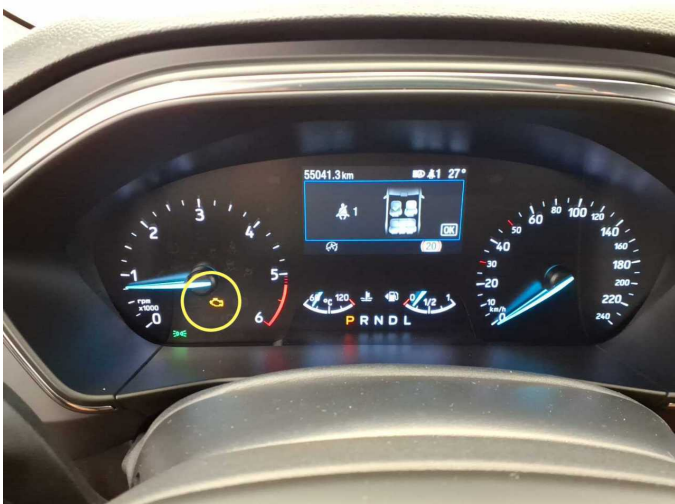
Damage 4: Instrument panel: Indicator light (Motorkontrollleuchte, nicht fahrbereit) - on - Perform diagnosis