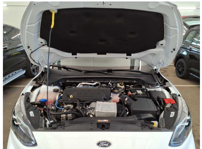
Figure 22: Misc.