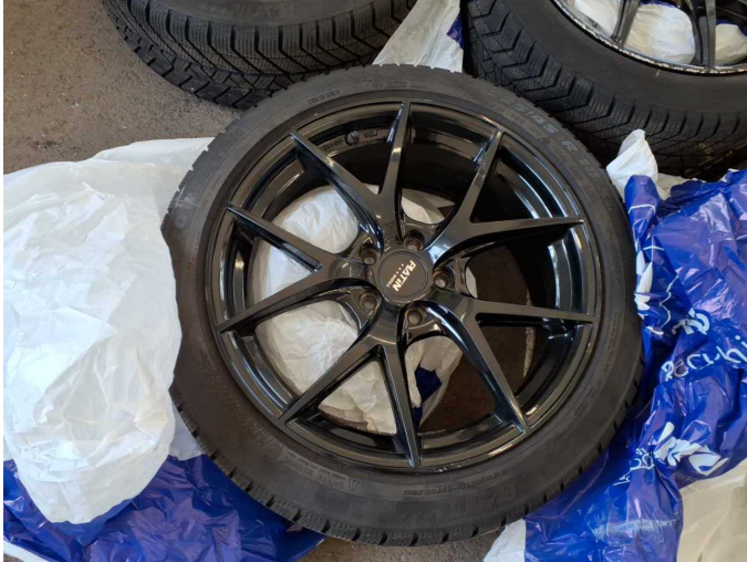
Figure 25: Misc.