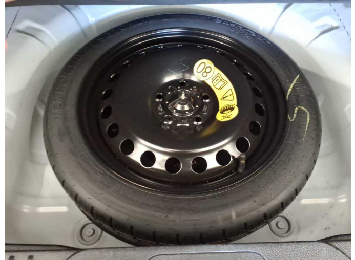
Figure 26: Misc.