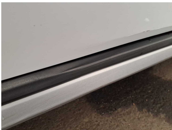
Accident 1: Side right