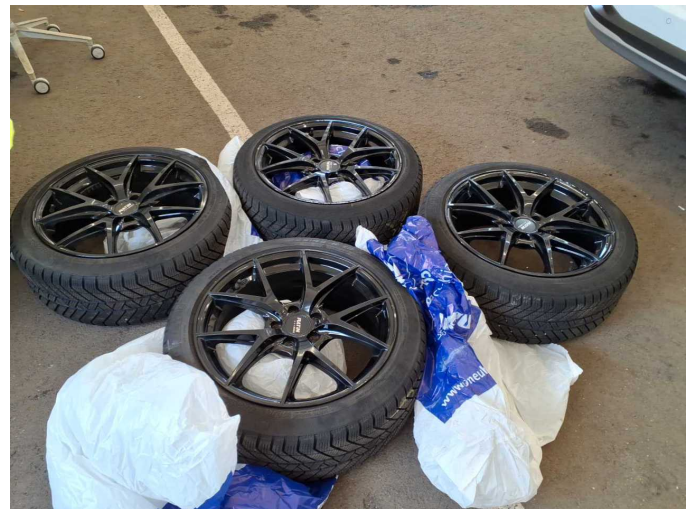
Figure 16: Additional tyres