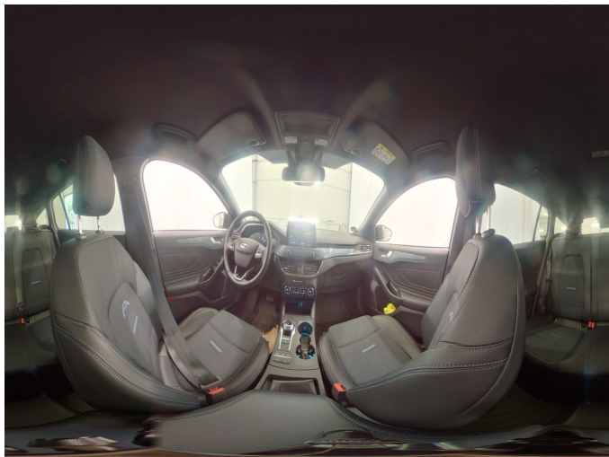
Figure 9: Interior 360° view