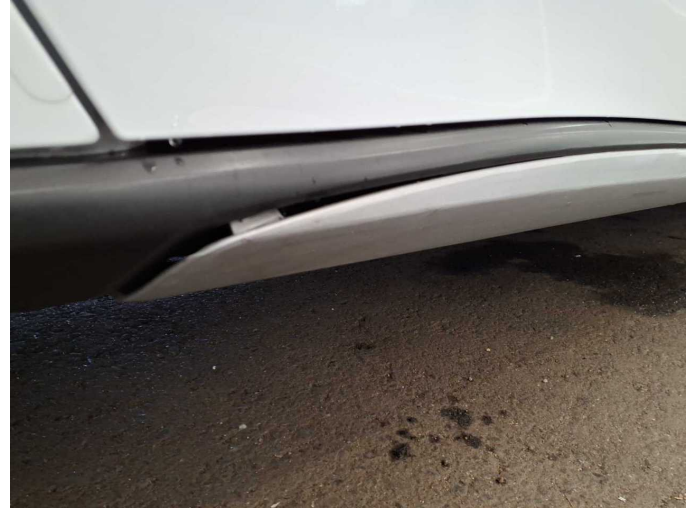
Accident 1: Side right