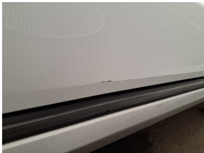
Accident 1: Side right