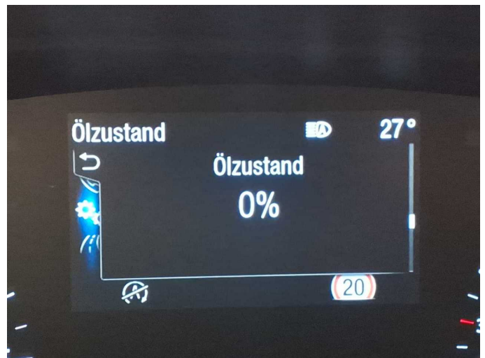
Damage 5: Misc.: Inspection / maintenance - Due - Perform