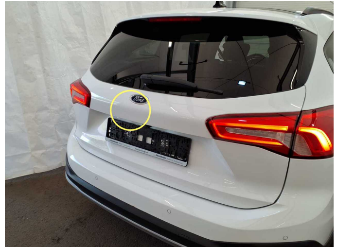
Damage 3: Boot lid / rear door: Boot lid - Scratch(es) - Smart repair