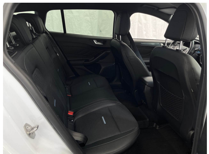
Figure 6: Interior - rear