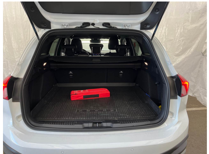
Figure 10: Cargo area