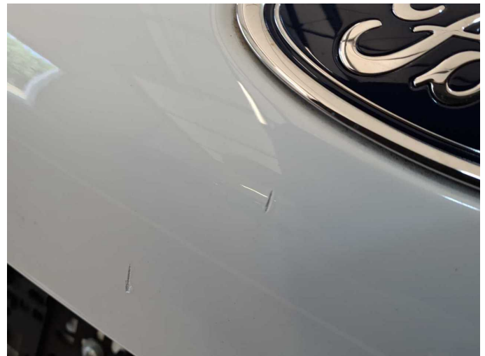
Damage 3: Boot lid / rear door: Boot lid - Scratch(es) - Smart repair