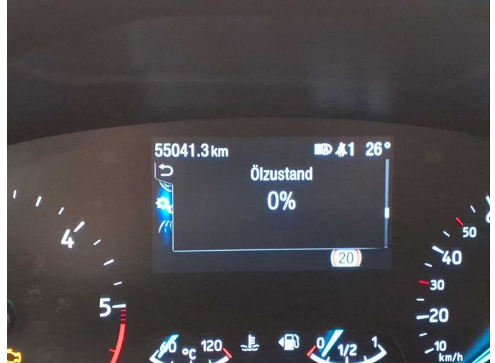
Figure 14: Documents