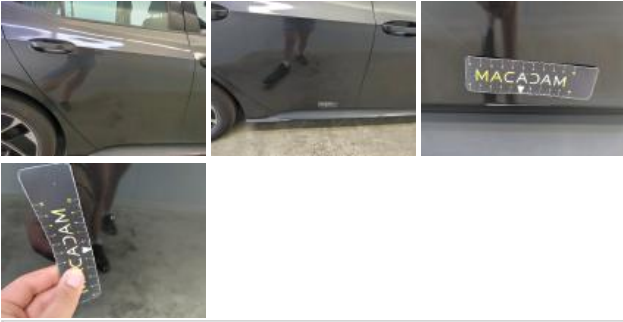
Wing RR, Dent(s) and scratch(es), Repair and paint (complete)