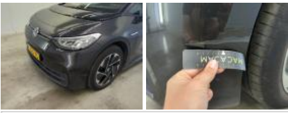
Door RR, Scratch(es), Repair and paint (complete)