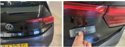
Bumper R, Scratch(es), Repair and paint (complete)