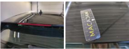
Tailgate / Boot, Scratch(es), Repair and paint (complete)