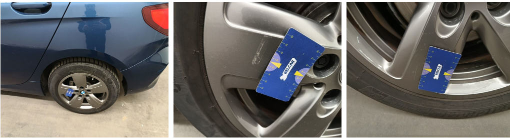
Wheel Alloy Rear Left // Repair-scratch