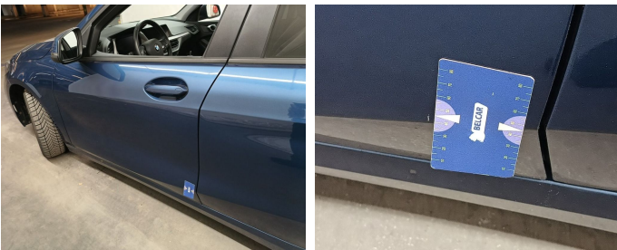
Door Front Left // Painting-scratch