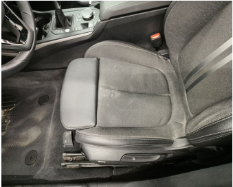
Interior Cleaning // Small-stain