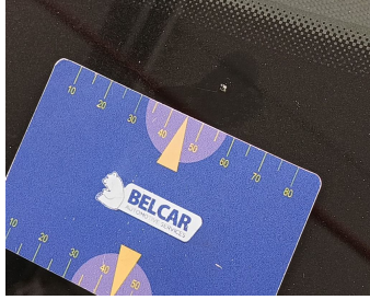
Windshield // Replace-glass damage