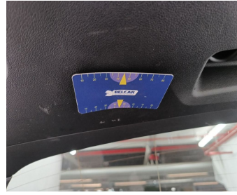
Trunk Lid Interior Coating / Complete Panel / Replace-scratch