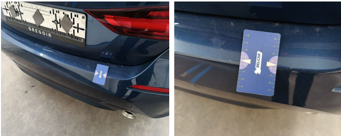
Bumper Rear // Polish-scratch