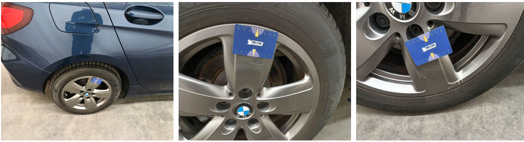
Wheel Alloy Rear Right // Repair-scratch