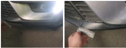
Bumper moulding FR, Unclamped, Dismount/Mount