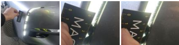
Bumper moulding F, Broken, Replace