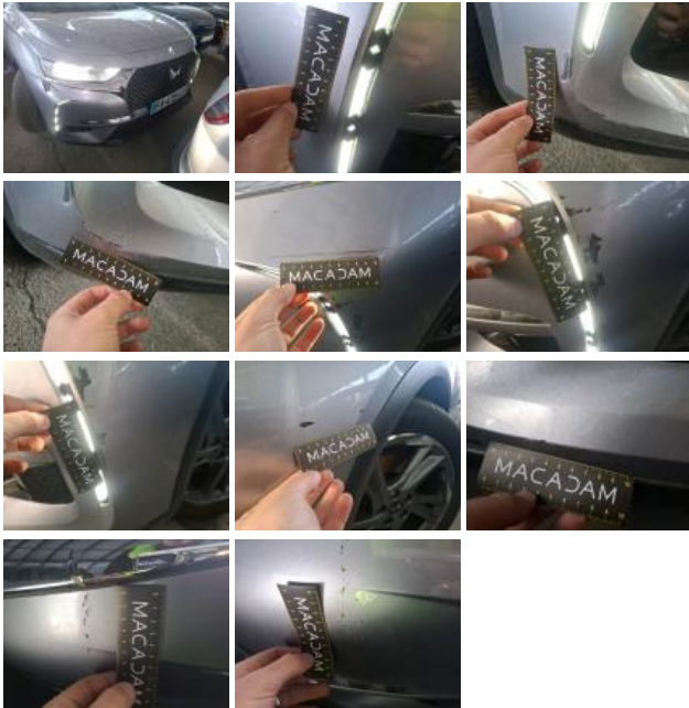
Bumper moulding FL, Unclamped, Dismount/Mount