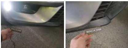
Daytime running light FR, Crack, Replace