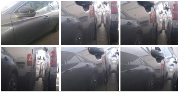
Bumper F, Scratch(es), Paint