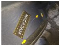
Alloy rim FL bitone/polychrome, Scratch(es), Repair/replace (lump sum)