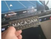
Headrest RR, Missing, Replace