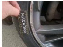
Alloy rim FR bitone/polychrome, Scratch(es), Repair/replace (lump sum)