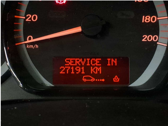
Figure 25: Misc.