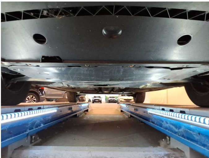
Figure 21: Misc.