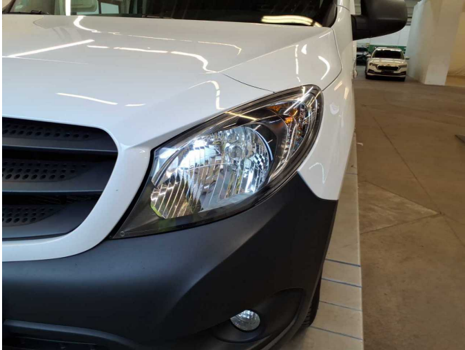
Figure 19: Misc.