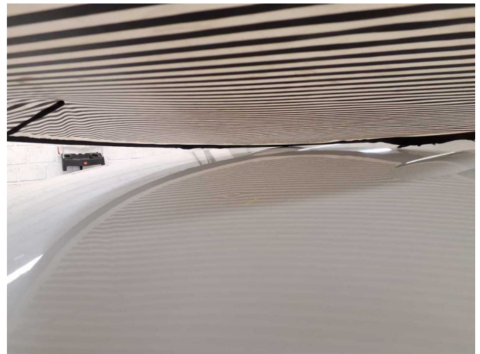
Damage 4: Body: Body - Damage by hail - Smooth repair work