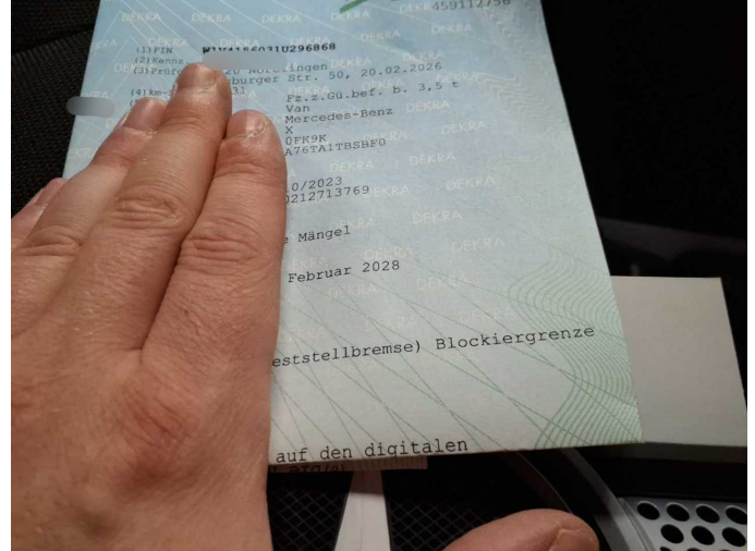
Figure 14: Documents