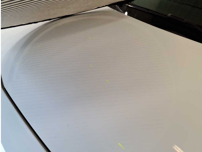
Damage 4: Body: Body - Damage by hail - Smooth repair work