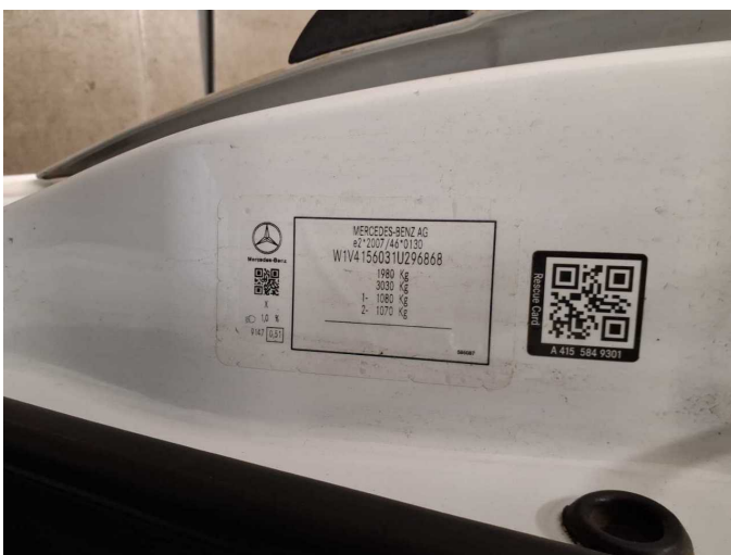
Figure 11: VIN