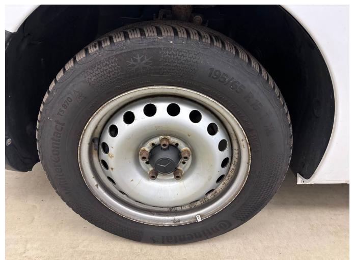
Figure 12: Mounted tyres