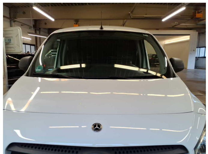
Damage 4: Body: Body - Damage by hail - Smooth repair work