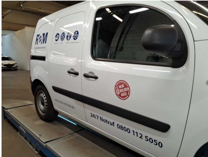
Damage 2: Body: Body - Glued / labelled - De-glude / neutralise