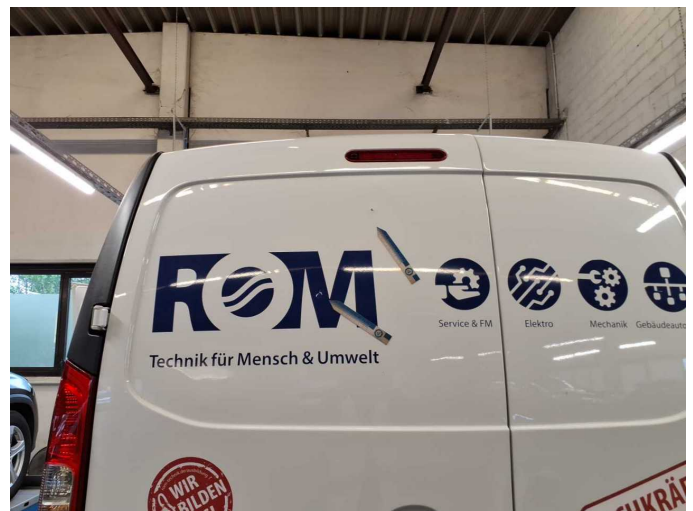
Damage 5: Boot lid / rear door: Rear door - left side - Dent / paintcoat damage - Paint