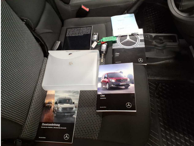
Figure 13: Documents