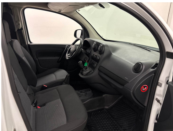
Figure 5: Interior - front