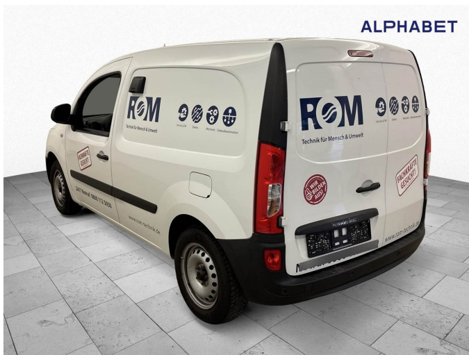
Figure 3: Diagonal rear (left)