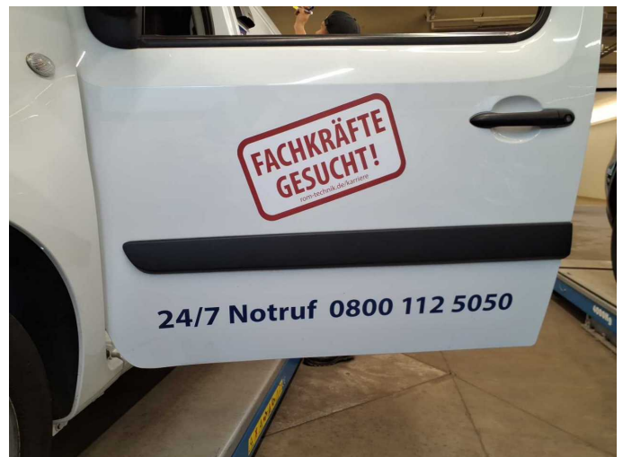
Damage 2: Body: Body - Glued / labelled - De-glue / neutralise