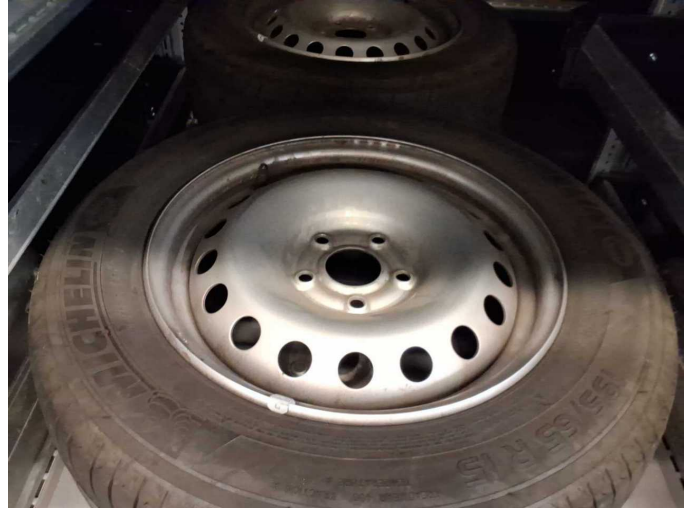
Figure 20: Misc.