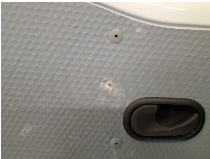
Damage 1: Trim / covers: Boot lid - interior trim - Broken / torn - Replace