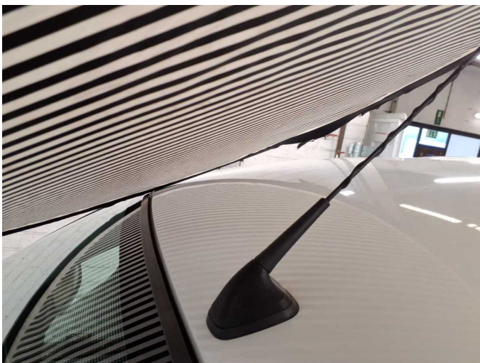
Damage 4: Body: Body - Damage by hail - Smooth repair work