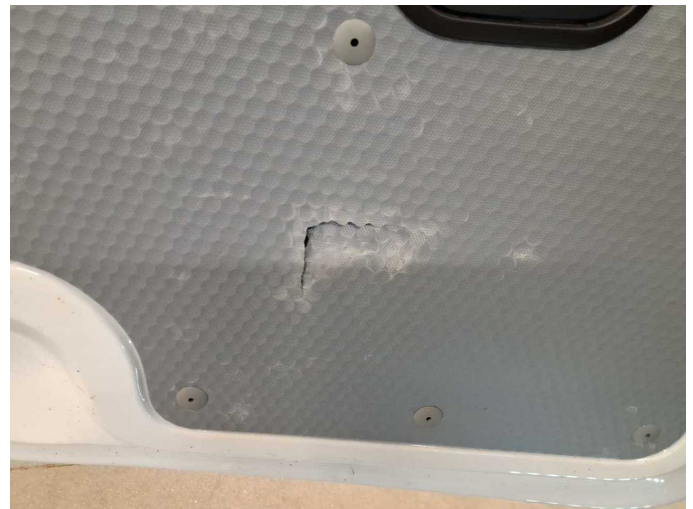
Damage 1: Trim / covers: Boot lid - interior trim - Broken / torn - Replace