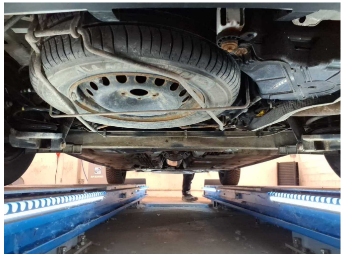
Figure 22: Misc.