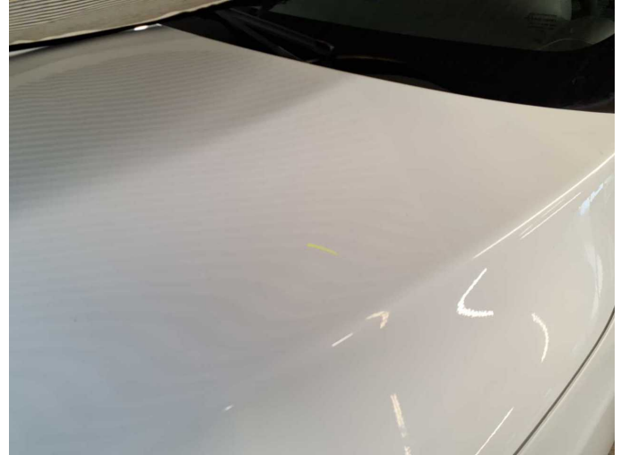
Damage 4: Body: Body - Damage by hail - Smooth repair work