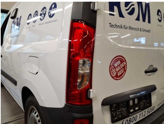
Figure 23: Misc.