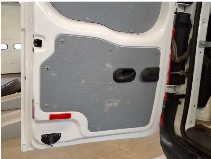
Damage 1: Trim / covers: Boot lid - interior trim - Broken / torn - Replace