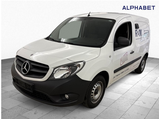
Figure 1: Diagonal front (left)