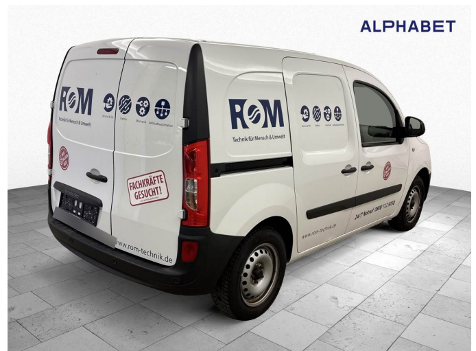
Figure 4: Diagonal rear (right)