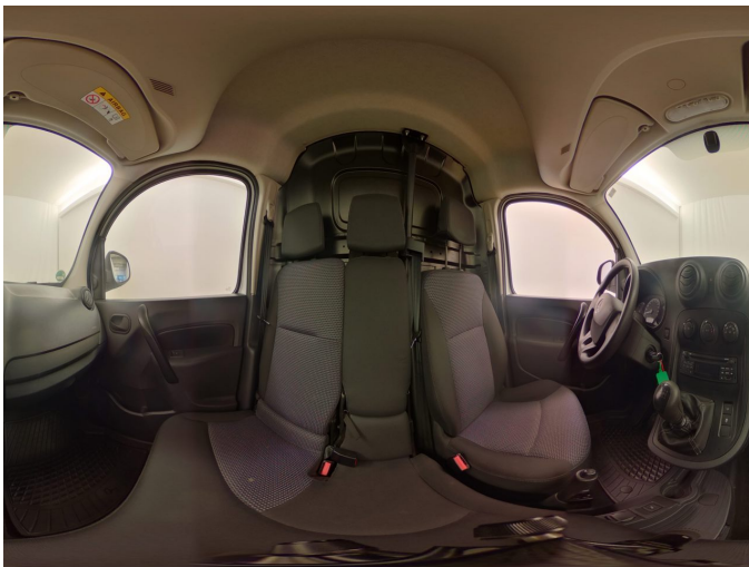
Figure 9: Interior 360° view