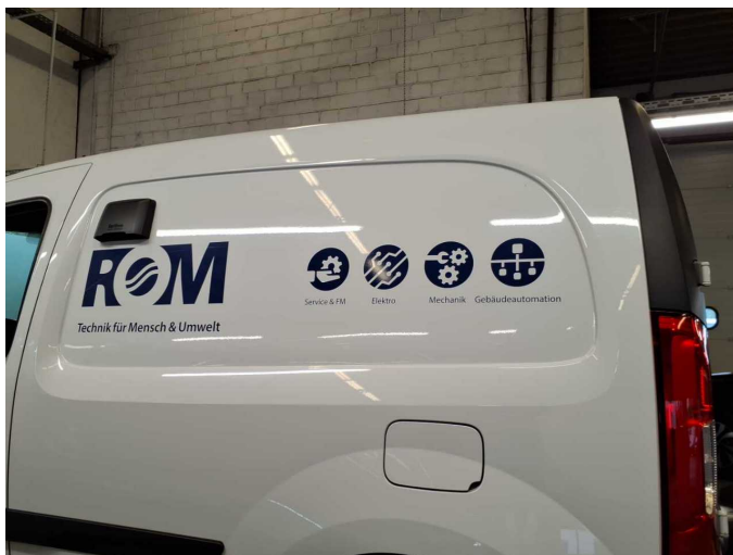
Damage 2: Body: Body - Glued / labelled - De-glude / neutralise