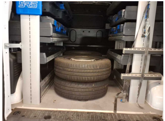
Figure 16: Additional tyres