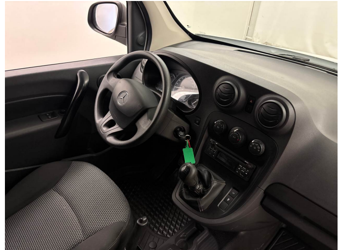
Figure 8: Instrument panel