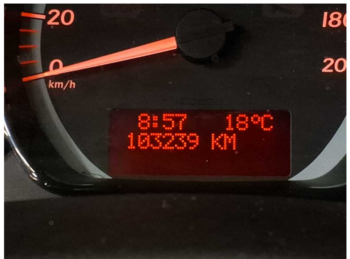
Figure 24: Misc.