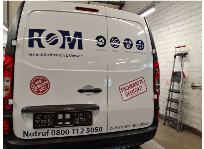
Damage 2: Body: Body - Glued / labelled - De-glude / neutralise