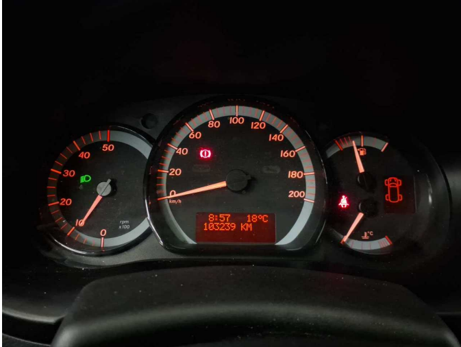
Figure 7: Instrument cluster