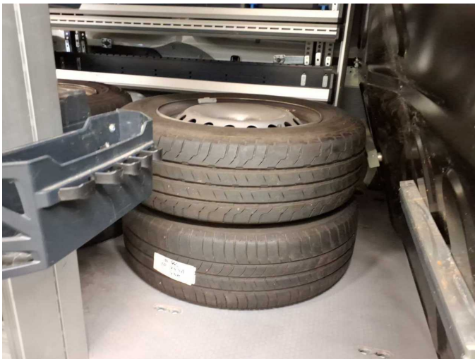
Figure 15: Additional tyres