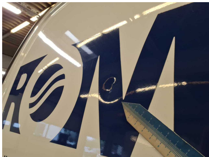
Damage 5: Boot lid / rear door: Rear door - left side - Dent / paintcoat damage - Paint