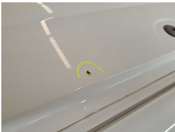
Damage 3: Roof: Roof - Corrosion - Paint