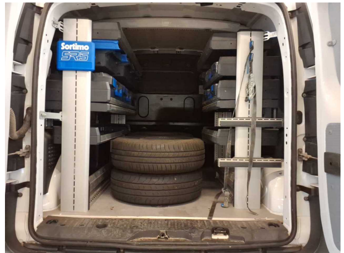
Figure 10: Cargo area