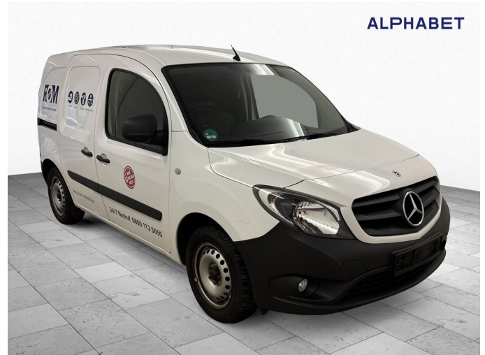
Figure 2: Diagonal front (right)