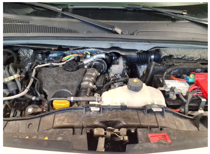
Figure 18: Misc.