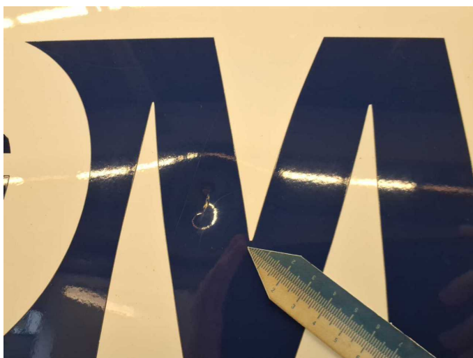
Damage 5: Boot lid / rear door: Rear door - left side - Dent / paintcoat damage - Paint