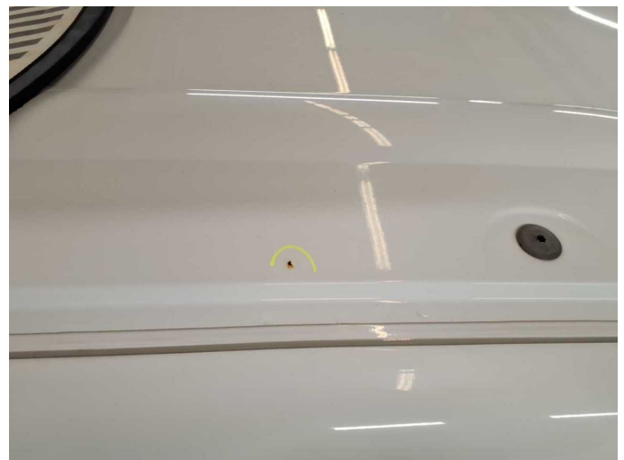
Damage 3: Roof: Roof - Corrosion - Paint