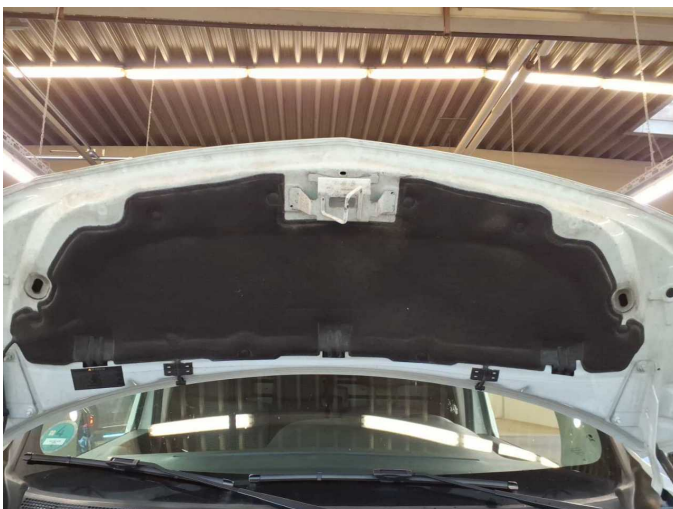
Figure 17: Misc.