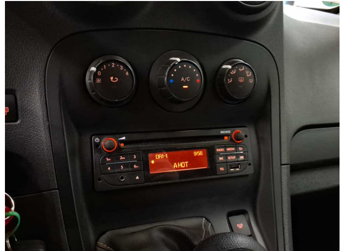
Figure 26: Misc.