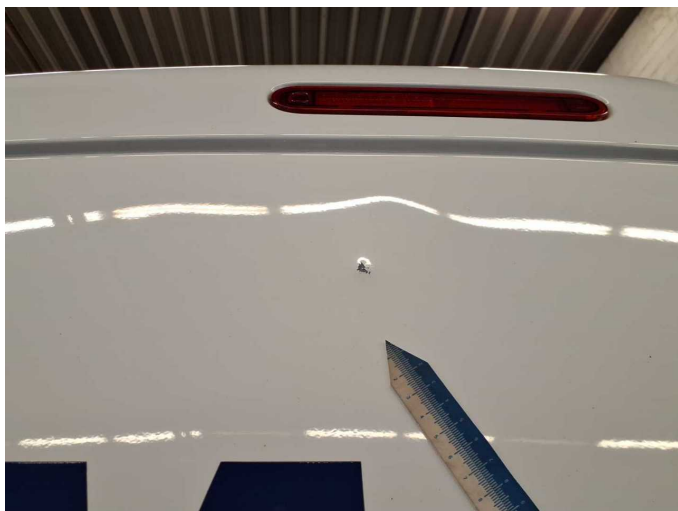
Damage 5: Boot lid / rear door: Rear door - left side - Dent / paintcoat damage - Paint