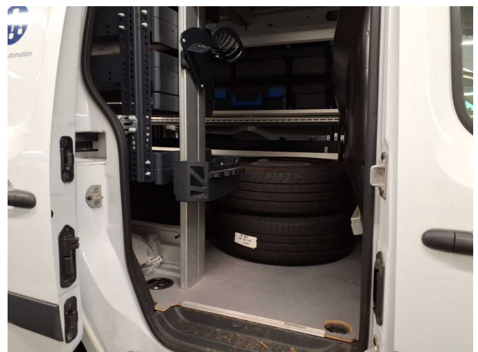
Figure 6: Interior - rear